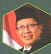
Lukman Hakim Saifuddin Minister of Religious Affairs, RI