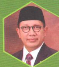
Lukman Hakim Saifuddin The Minister of Religious Affairs, RI