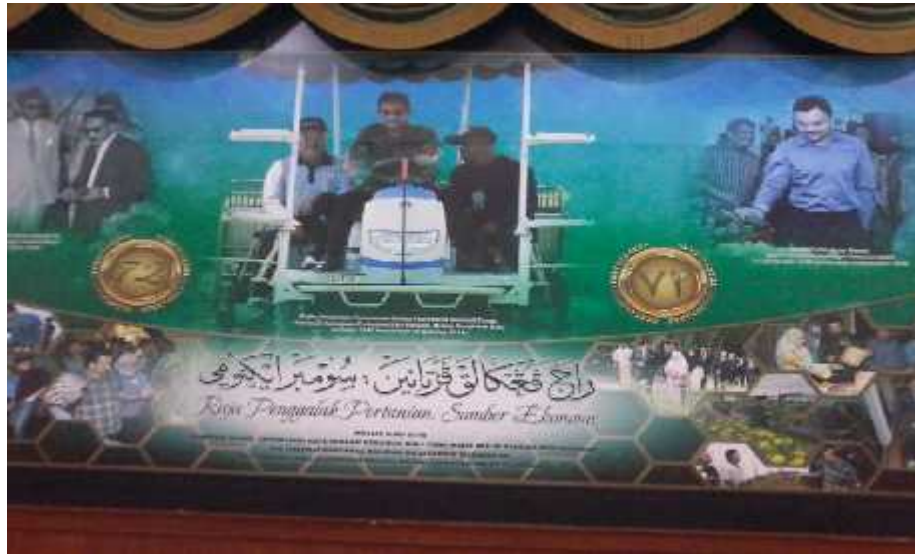
Figure 4.73. “Raja Penggerak Pertanian: Economy Resource”