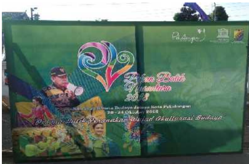
Figure 3. 1. Indonesian Batik Week

The geographical condition of Pekalongan City, which is on the northern coastline, has a lot of influence on a fairly extensive trading network. Not only that, the influence of communication with many ethnicities makes the character of Pekalongan people more egalitarian, both with natives, Arabs and Chinese, especially in trade activities. Even from the textile industry, ranging from traditional textile factories using only hand looms, to modern textile industries with machine-powered looms. In the same way, individuals who run retail businesses can be very diverse, from peddlers to stall or shop owners, many Chinese communities play roles in Java besides Sumatra. The production of coastal batik grew rapidly around the 1870s, supported by the progress of transportation in the presence of trains and steamers. Batik traders and producers try to meet diverse consumer tastes, which always demand new innovations. As a result, batik made along the coast, especially in Pekalongan, became very dynamic. 9