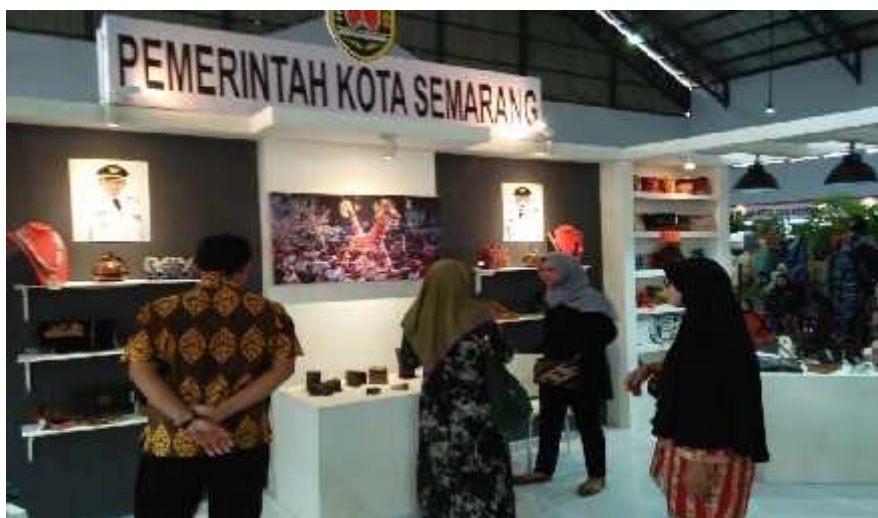
Figure 3. 12. Semarang City Government Participation in Batik exhibition

The batik entrepreneurs in Djadoel village, Semarang are not only having tendencies on economics, but also in social and education about batik. This is evidenced by the batik making practices for visitors or tourists both from within and outside of the country. Apart from entrepreneurs, the Semarang city government is also concerned about the development of Semarangan batik, namely by participating in a series of batik exhibitions held in various cities.