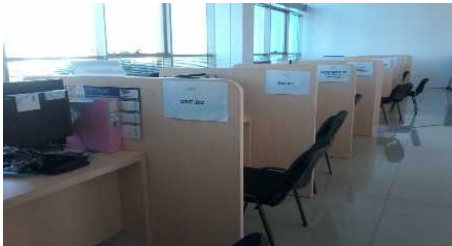
Figure 4. 71. DARE's One Stop Service System

DARE facilitates to prospective entrepreneurs by providing a one stop service system. This system is a variety of counseling services ranging from products, finance, and marketing. It aims to enable the prospective entrepreneurs dealing with organizing their needs and consulting with the provided supervisor. This service is carried out by DARE since the existence of each DARE office is quite far. The integration of the