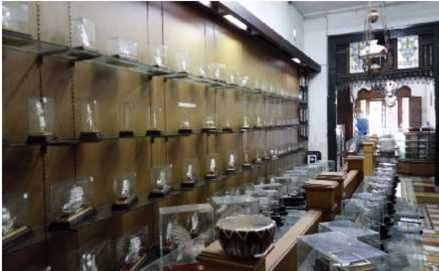
Figure 3. 50. Various Silver Crafts