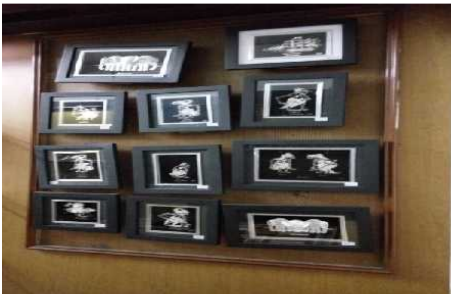
Figure 3. 51. Various Silver Puppet Handicrafts