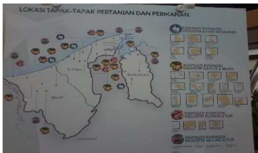
Figure 4.72. Identification of Agriculture and Fishery Sites, Brunei 2018

Brunei Darussalam has regularly held a wide array of exhibitions of various local products. It can be seen that the Sultan prioritizes the identification of income sources from the agriculture and fishery sectors. This priority is due to the fact that some food such as rice is still obtained from imports. The government identification is presented in Figure 4.72.