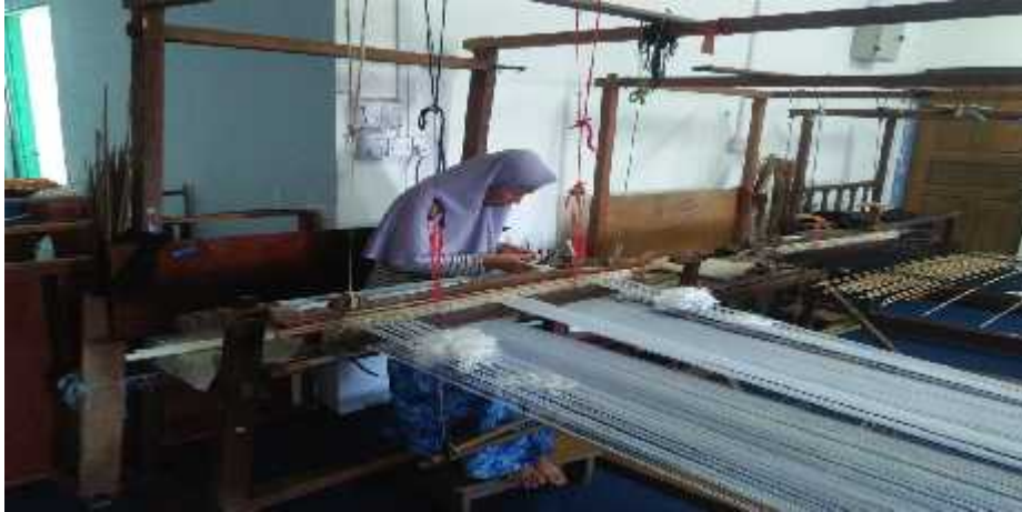
Figure 4. 88. Process of Weaving at Rosmawey