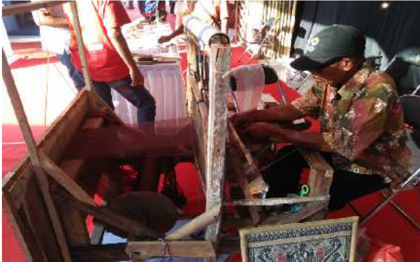
Figure 3. 35. Tenun Troso Production Process

such as weaving, convection and furniture drop dramatically. The turnover of the weaving business itself, according to Mr. Buchori, decreased to 50%, which at first had a monthly turnover of 50 million IDR, decreasing to 20 million IDR to 30 million IDR.