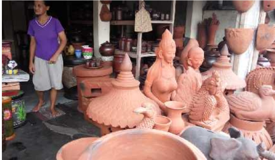
Figure 3. 42 Pottery Craft Shop, Kasongan, Bantul, Yogyakarta

Businesses that have been established for decades have experienced a variety of problems, starting from capital issues, scarcity of clay, including the presence of factory products made from plastic which affected their business growth. However, they also have their own market share, namely antique collectors.