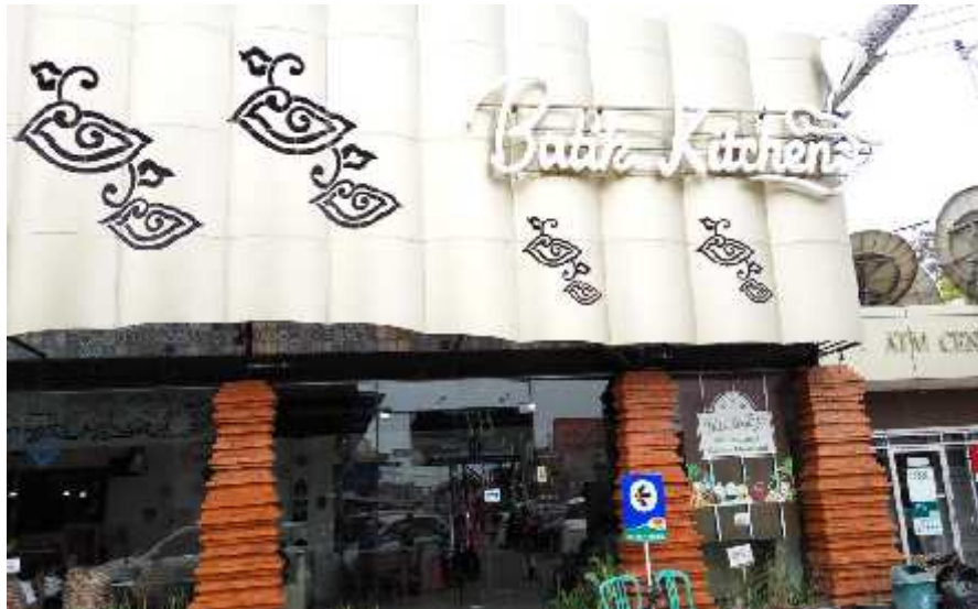
Figure 3. 58. Restaurant with Batik Atmosphere