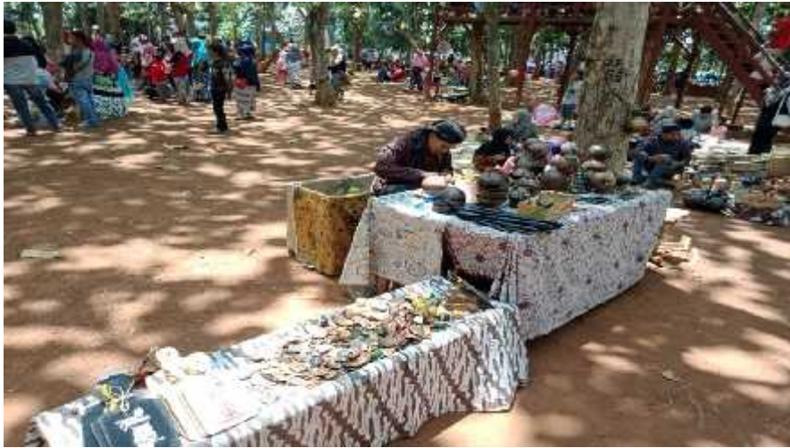
Figure 3. 15. Minggong Jati Activities, Batang Regency