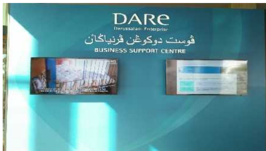
Figure 4. 67. DARE (Darussalam Enterprise)

There are, moreover, three main programs run by DARE, namely: 1) startup business with a 100-day mentoring period so that DARE is expected to be able to evaluate each business up to three times in a year, 2) Industry Business Academy, that is classical and free of charge, and 3) Micro Business Boot camp which has been already holding since January 2018. The Micro Business Boot camp opens to Bruneians and permanent residents and quarantine the participants in the natural environment. They participate in a one-week OBBD (Out Bound Brunei Darussalam) with a group consisting of 15 people and ranging from 18 to 40 years old.