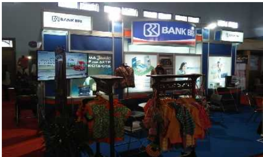
Figure 3.6. 2018 International Batik Exhibition

At batik exhibition events, which are always held by the government of Pekalongan City annually, representatives of batik entrepreneurs from almost all provinces in Indonesia are participating. The involvement of banking institutions in the development of the batik business is also quite significant through the partnership program. The presence of banking institutions in the exhibition arena strengthens the form of cooperation that is always open and offered to batik entrepreneurs to keep developing.