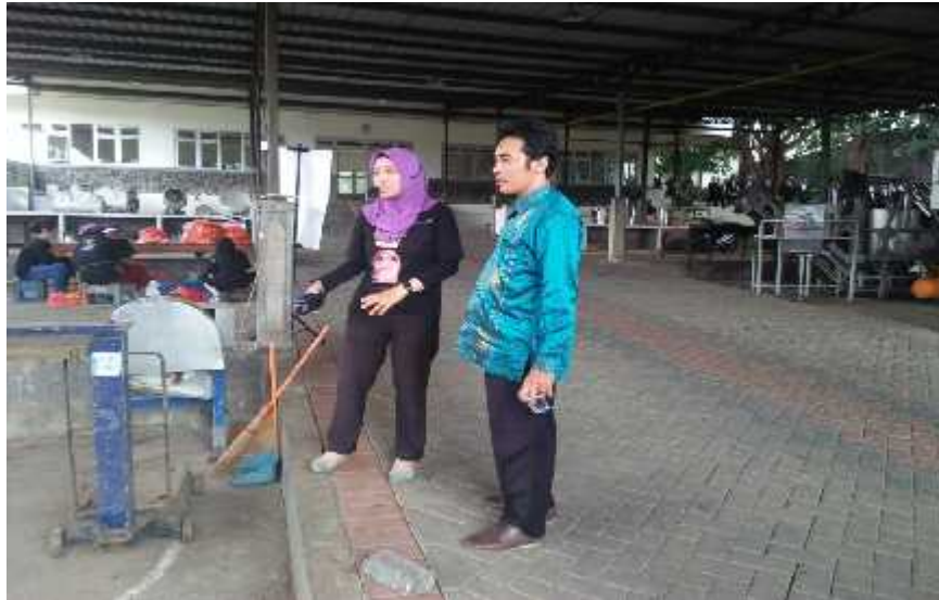
Figure 3. 63. Sorting Room of Telo which has Good Quality

Unggul, for example, was processing his sweet potato product into buns which is named BakpaoTelo. “Initially I tried to build a brand image through the production of bakpaotelo. I tried to prove that from cassava which has selling price around 200 rupiah/ kg, it could be increased to 750 to 1,000 rupiah every kg, even more than Rp 2,000 after turned into telo buns,” he said . From four hectares of his potato crops are processed into buns, recently it develops into 23 hectare with 12 plasma farmers. The need for sweet potatoes which are used to make buns at this time only reached three to four tons everyweek to produce 2,000-7,000 buns each week.