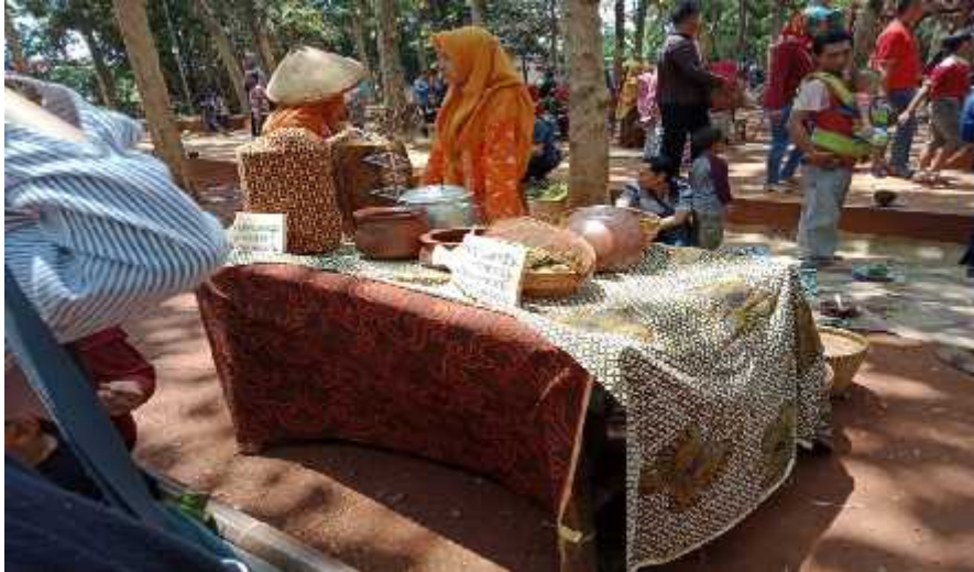
Figure 3. 17. Minggong Jati Activities, Batang Regency

Trading activities in the Minggong Jati area are multidimensional; the types of food and handicrafts sold, equipments used, clothings worn by the sellers and the atmosphere are all in old Javanese nuances. This breakthrough is a new icon of Batang Regency to attract tourists. This activity is very important for local micro traders, and has succeeded in encouraging small entrepreneurs to remain confident in running their businesses. This activity is very helpful for basket crafts, pottery, coconut shells and various other tools which until now still have their own market share.