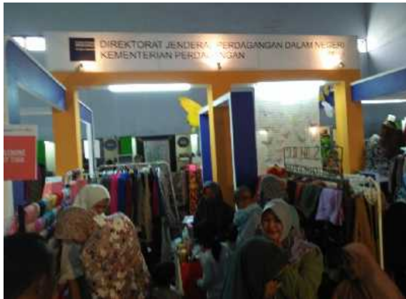
Figure 3. 4. 2018 International Batik Exhibition