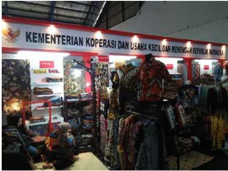
Figure 3.3. 2018 International Batik Exhibition