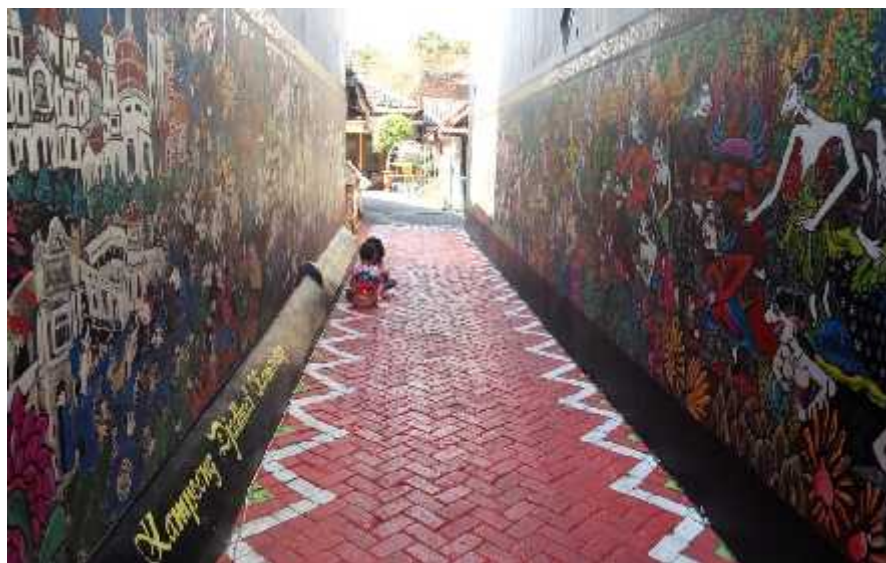
Figure 3. 10. Kampung Batik Djadoel Rejomulyo, Semarang