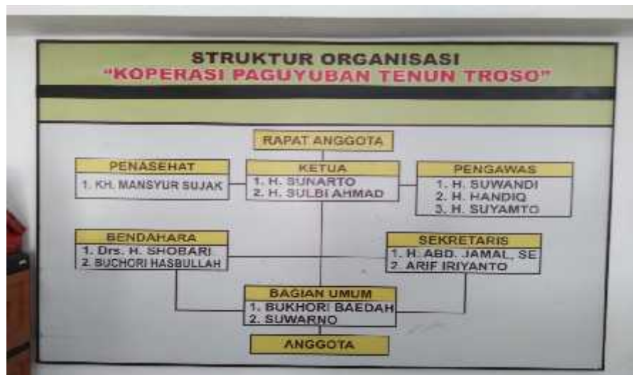
Figure 3. 33. Organization Structure Paguyuban Tenun Troso Cooperation, Jepar