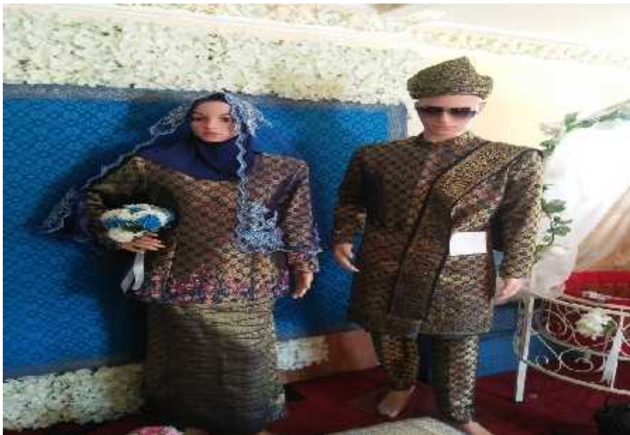
Figure 4.87. Display of Rosmawey's Woven Products

The Rosmawey's efforts in maintaining its excellent services and quality of their products for years have won an award from the kingdom as a company that always maintains its reputation and market share and is regarded to demonstrate good leadership. The award, product display, and production process are presented in Figure 4. 86., Figure 4. 87., and figure 4. 88.