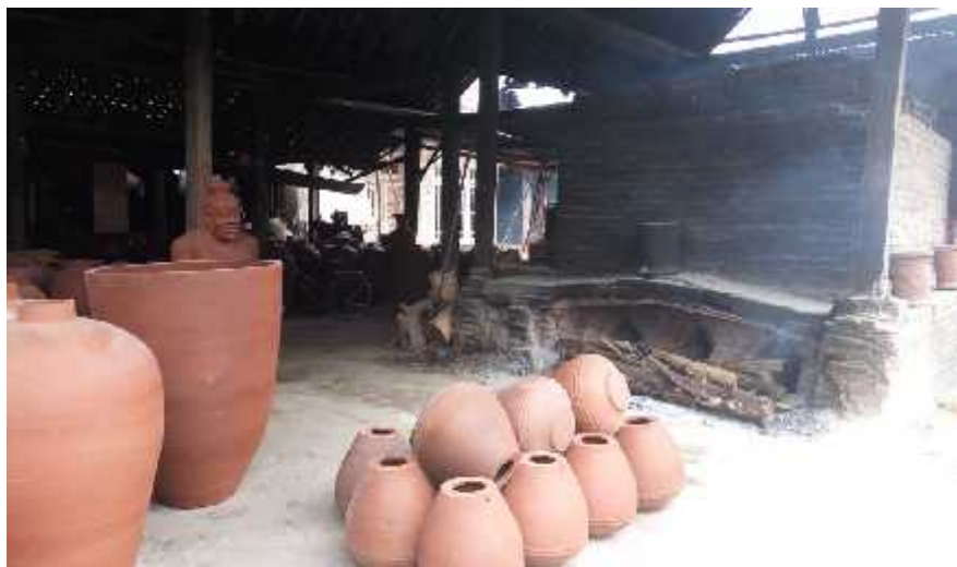
Figure 3. 46. Pottery Burning Room

The process of making ceramic crafts can be categorized depending on the weather, besides the patience and imagination of the craftsmen. Weather plays an important role in the drying process. That process is not done directly under the sunlight, but is done indirectly. Generally, they put half--finished products in a separate room equipped with a fireplace or furnace which produces smoke. The condition in this room is made warm so that the product can dry slowly. This process greatly affects the quality of the product. The water content on cloudy day influence the drying process become slower and it affects to the quality of the product.