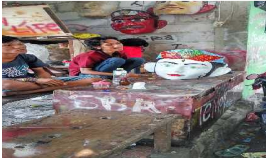
Figure 3. 27. Al Fathir Betawi Ondel-Ondel Art Workshop activity

but by using fiber which is considered more practical. The difference in material between used paper compared to fiber is very influential on the quality of the ondel-ondel produced. Quality made from fiber is smoother, easier to paint, and durable.