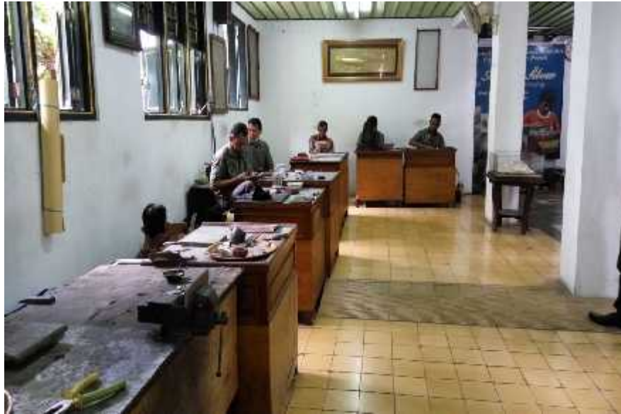
Figure 3. 54. Silver Craft Production Room

Most of the employees who in charge of making silver handicrafts are men, it is different from batik craft even though it has a high level of complexity, but for metal-based handicrafts it is still run by the majority of men. Basically there is no particular reason why men dominate, but it has become a hereditary tradition in this business, the producing process is mostly done by men, while women are more likely to work in the finishing section.