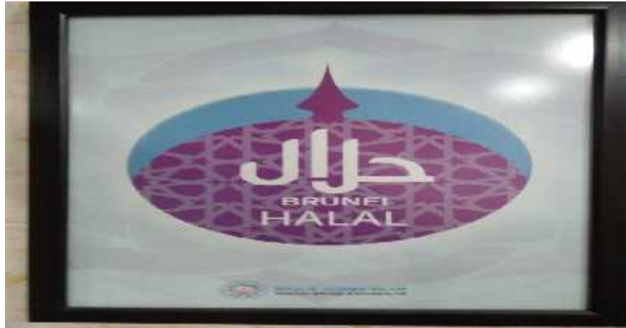
Figure 4.78. Halal Certificate Issued by the Brunei Darussalam Government

transaction. For this reason, the Sultan has applied the government policy regarding halal food. It is evidenced by the halal food control by issuing halal certificates that must be displayed in every business sites as it is shown in Figure 4. 78.