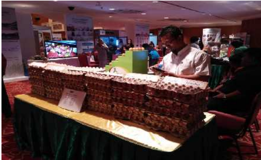
Figure 4. 75. Stand of Poultry Farming and Egg Production