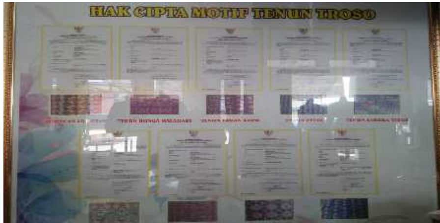
Figure 3. 34. Tenun Troso Pattern Copyright

business which also produces the same product. If Ampel Jaya only produces Balinese weaving, KF Kayra main products are Balinese weaving and also other products as previously mentioned above. Unlike Ampel Jaya and KF Kayra, the Tenun Limo weaving business produces a wide range of products other than Balinese weaving. The motif of the weaving products has been registered for copyright.