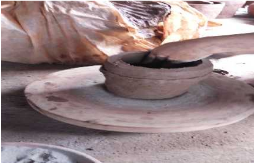
Figure 3. 47. The Process of Making a Vase