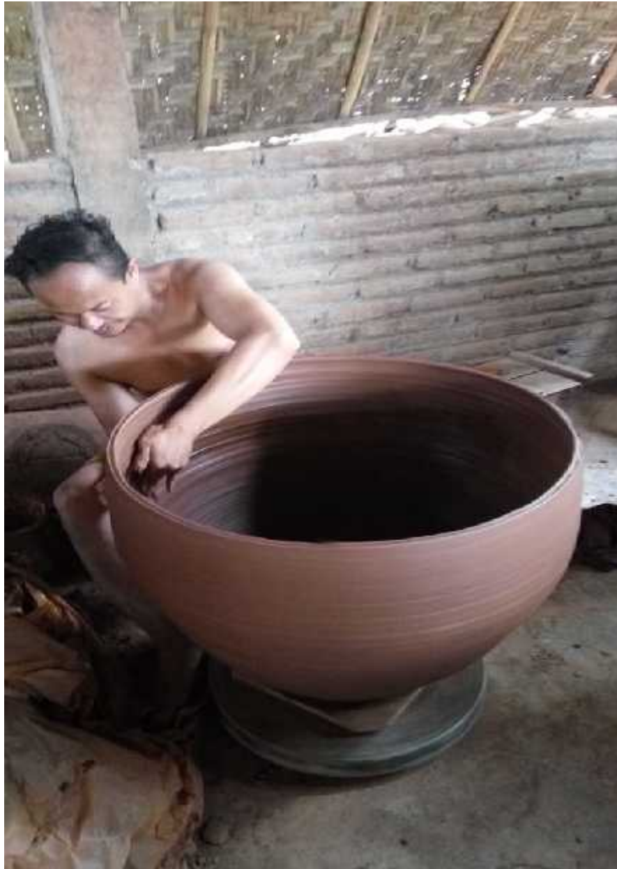
Figure 3. 48. The Process of Making a Big Vase