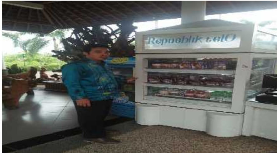
Figure 3. 62. Various Processed Telo

Since the previous government and continues until now. None of the policies are produced can reach what farmers need. Even political parties use farmers for their own benefit,” said the man who won the 1996 National Level Pioneer Youth Award. Even if something changes according to Unggul, it is only limited to government actors. However, it did not effect on to improvement of farmers’ dignity. “All this time farmers is only commanded to meet production targets such as, rice self-sufficiency program.