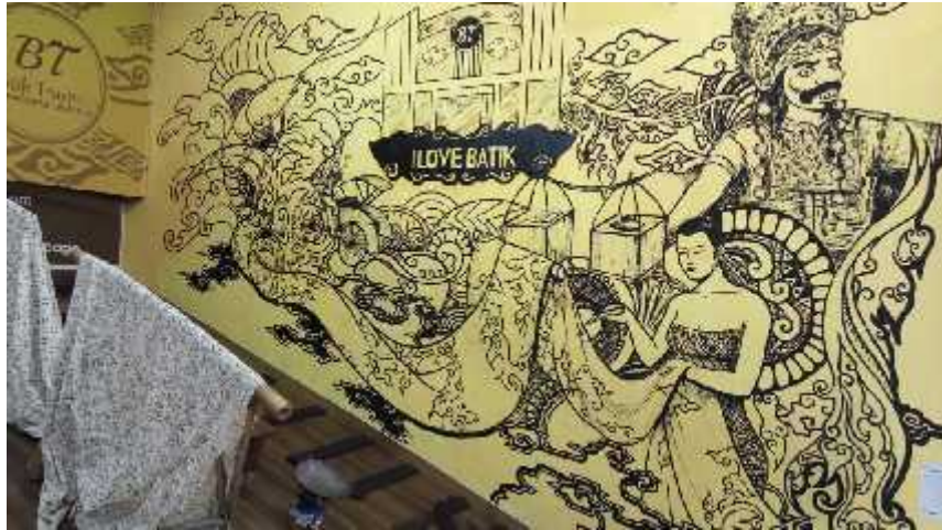
Figure 3. 60. Batik Painting on the Wall