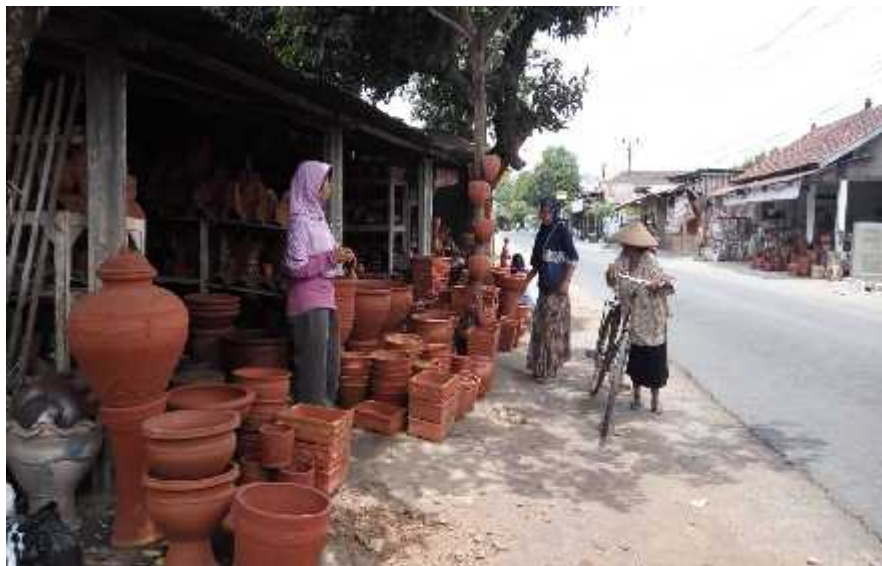
Figure 3. 43. Pottery Sale and Purchase Activities, Kasongan, Bantul, Yogyakarta