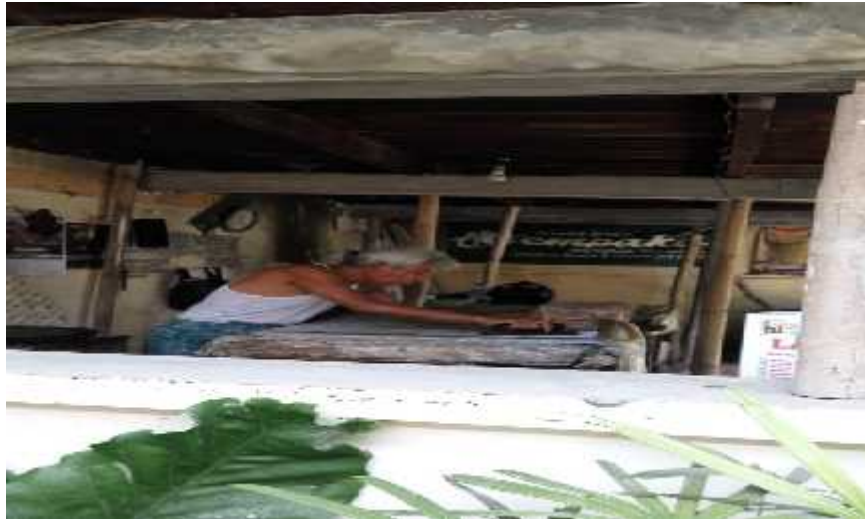
Figure 3. 22. Ngecap Batik Activity

Batik companies that can be found in Laweyan are entirely owned by Javanese people. The famous batik production from the area is printed batik cloth, which is relatively cheap. The term cheap has become a means of promotion that attracts the attention of consumers to leave fine batik, which is unproductive and expensive. The batik tulis production system has become long and slow. With the discovery of " cap " (stamp) system, there will be a change in industrial character that is parallel to the development of production nature from the "craft" "carpentry" system.