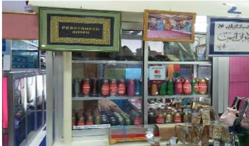
Figure 4. 82. Types of Yarns Used for AIMAAN's Woven Fabrics