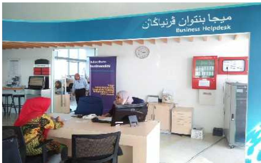
Figure 4. 69. DARE Services/Counseling