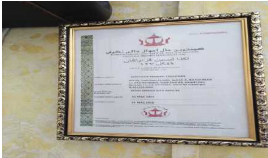
Figure 4.77. Halal Certificate Issued by the MUIB

Furthermore, Figure 4.77. demonstrates that the government of Brunei Darussalam assures halal products and consumer safety by providing halal certificates. It is done to perform government's obligation for giving a sense of security to the public and support the development of the Bruneians' businesses. Likewise, it is because halal product assurance is expected to be able to increase tourist visits.