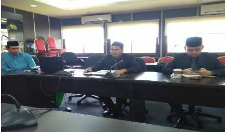
Figure 4. 66. Presentation of UNISSA’s Policy on Business Activities