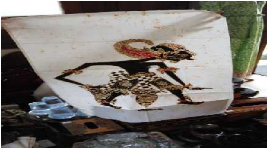
Figure 3. 24. Batik Laweyan Wayang Painting Creativity