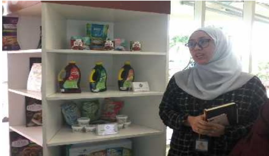
Figure 4. 68. Products Yielded in DARE Programs