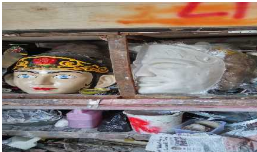
Figure 3. 31. Ondel-Ondel Reparation Workshop, Al Fathir Art Studio

The production of ondel-ondel also requires persistence and patience. Even so, even though their only capital is observation, most craftsmen have been able to do it. They generally do self-taught in the learning process of making ondel-ondel. There are no specific instructors or foremen, they usually remind each other if one of the craftsmen makes a mistake or there is a lack in making ondel-ondel.