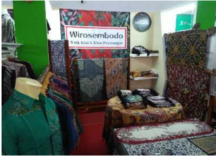
Figure 3.5. 2018 International Batik Exhibition

At batik exhibition events, which are always held by the government of Pekalongan City annually, representatives of batik entrepreneurs from almost all provinces in Indonesia are participating. The involvement of banking institutions in the development of the batik business is also quite significant through the partnership program. The presence of banking institutions in the exhibition arena strengthens the form of cooperation that is always open and offered to batik entrepreneurs to keep developing.