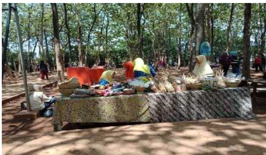
Figure 3. 14. Minggon Jati Activities, Batang Regency