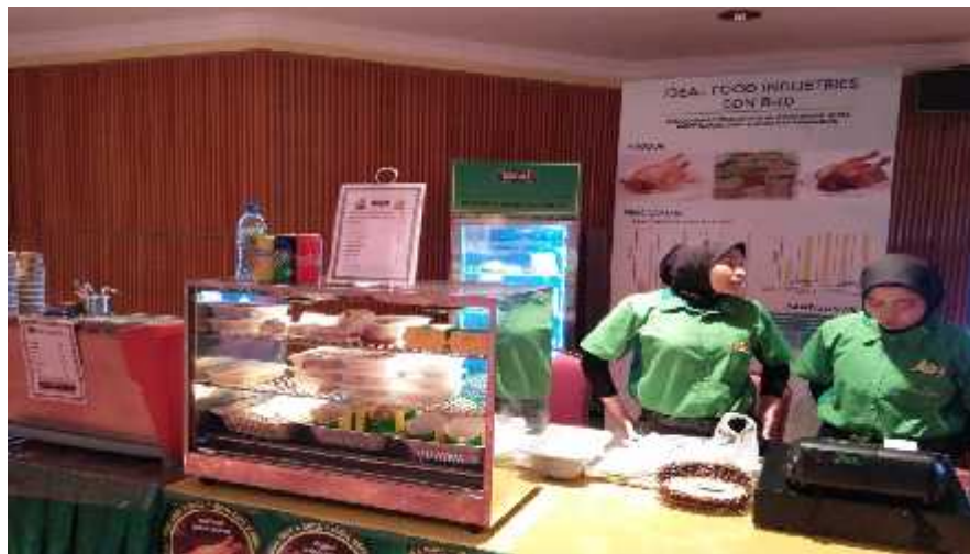
Figure 4. 76. Stand of Processed Products Made of Chicken Meat