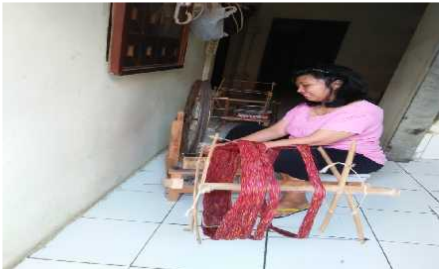
Figure 3. 36. Tenun Troso Thread Rolling Process