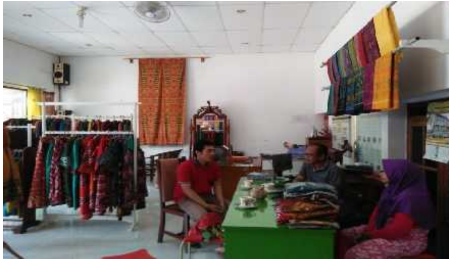
Figure 3. 38. Display Room and TrosokayraJepara Woven Fabric Store

Seen from its market share, craftsmen prefer a comfort zone. As done by Ampel Jaya's weaving business which only focuses on Bali with its Balinese weaving products, and KF Kayra which its main focus is also on Bali with the same products even though KF Kayra is also still producing other products on demand. Although those two UKMs were together with Tenun Limo were facilitated by Muria Kudus University for exhibitions in Thailand and Brunei. From those three SMEs, KF Kayra is the most often SMES that included in exhibitions by the Central Java Industry and Trade Cooperative Office, and also by PT Telkom because it is also a fostered partner of PT Telkom. Whereas the most diligent participants in the exhibition are Tenun Limo either facilitated or independently. Meanwhile, Ampel Jaya rarely joins exhibitions because Bali woven is the only focus for Bali market.