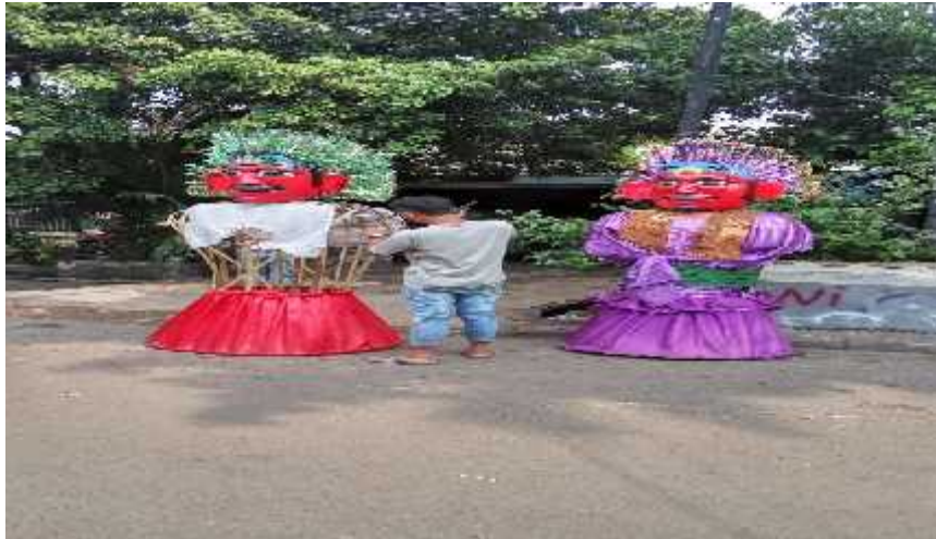
Figure 3. 28. Ondel-Ondel Production Activity