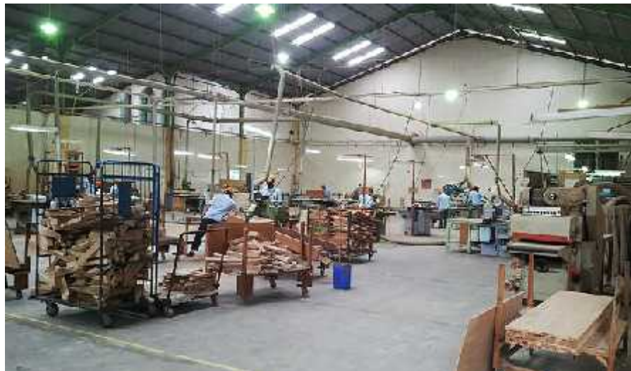
Figure 3. 40. Wood Cutting Room