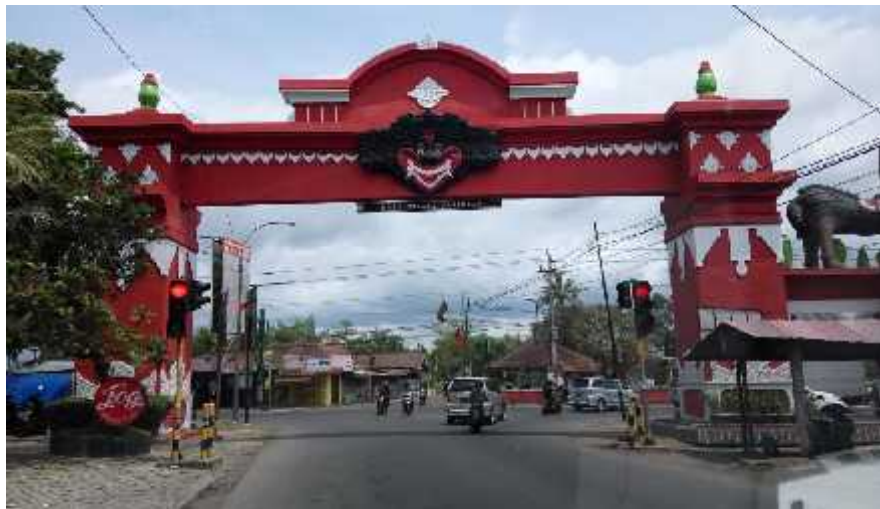
Figure 3. 41. Kasongan Pottery Craft Center, Bantul Yogyakarta.

“A lot of the employees come from Brebes because the quality of its clay is not good compared to the area of Yogyakarta and its surroundings, so the quality of the craft is different. Consumers can assess the quality of the products, and the products become less salable. So they don’t open their own business in Brebes and move to become employee here”