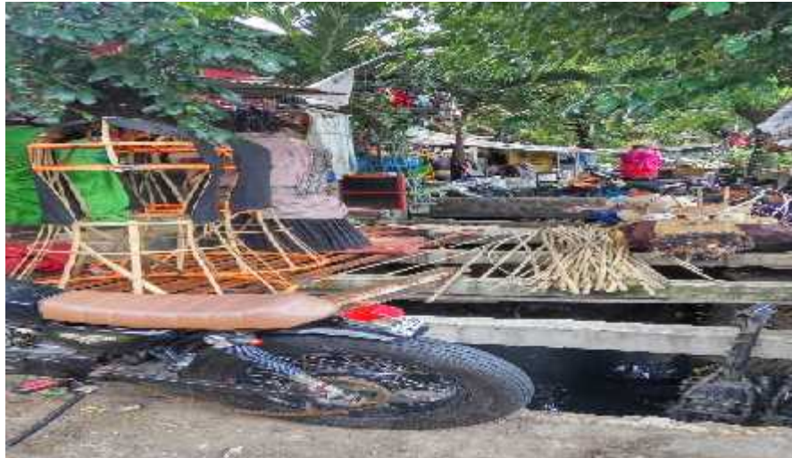
Figure 3. 30. Ondel-Ondel Frame Production, Al Fathir art studio

The production of ondel-ondel also requires persistence and patience. Even so, even though their only capital is observation, most craftsmen have been able to do it. They generally do self-taught in the learning process of making ondel-ondel. There are no specific instructors or foremen, they usually remind each other if one of the craftsmen makes a mistake or there is a lack in making ondel-ondel.