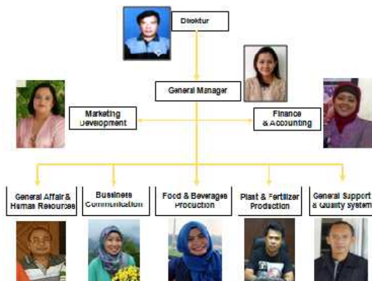
Figure 3. 64. Organization Structure