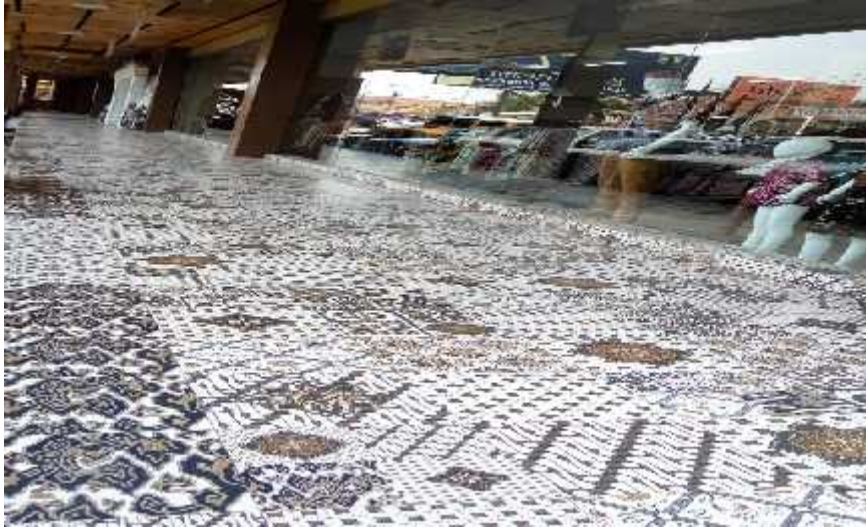
Figure 3. 55. The Use of Batik Pattern on the Floor

The media for batik is no longer bound for cloth only. The creativity of craftsmen to introduce batik to the public is growing rapidly. One of the media is on floor tiles. It gives different atmosphere for tourists while enter the center of making and selling batik in Cirebon. Besides, there are other already mediafor batik that has been introduced such as cloth, bags, jewelry, clothing, t-shirts, gloves, hats, bread / cakes, and so on. The production activities and trade transactions of Trusmi batik as one of the biggest batik icons are increasingly famous after the process of making copyright and recorded at MURI, Indonesia.