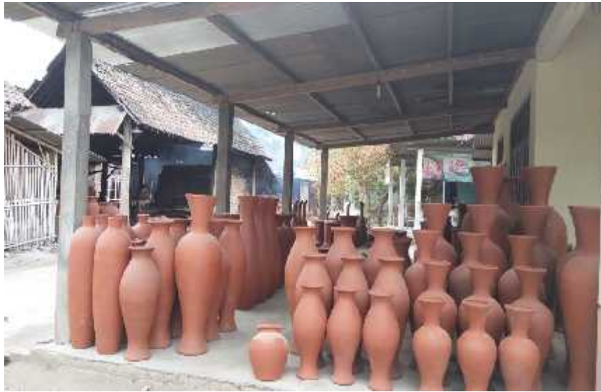
Figure 3. 49. Pottery that Ready to be Burn