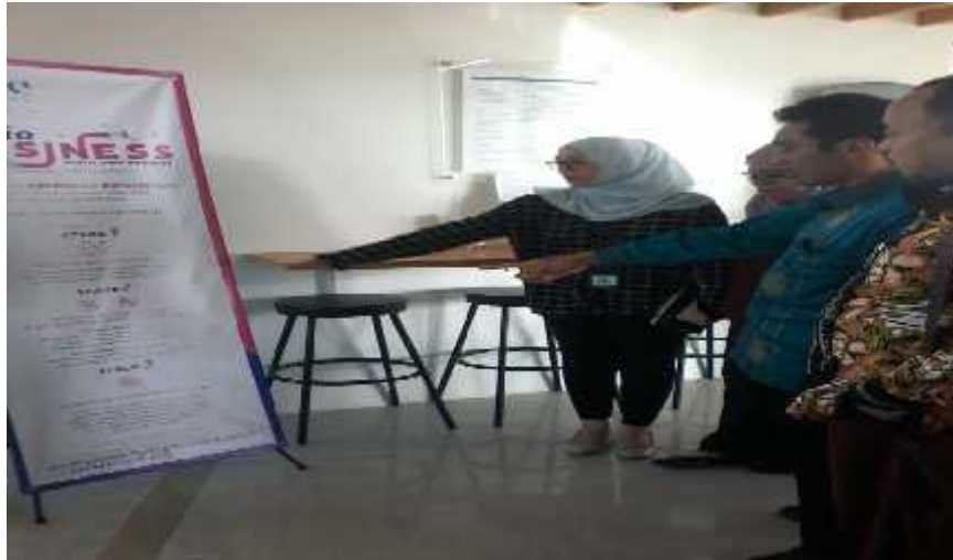
Figure 4. 70. Presentation by the DARE Officer on Startup Business