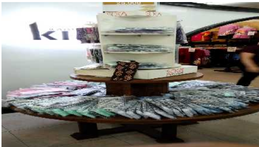
Figure 3. 59. Batik Socks Products