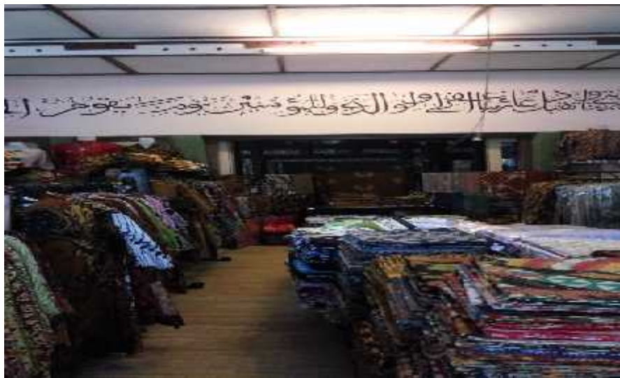
Figure 3. 23. Religiosity of Batik Laweyan Entrepreneurs

among businessmen families, are usually characteristic of what is called the kinship relationship of Laweyan merchants. This situation shows the existence of a high level of mobility in the economic attitudes of the merchants, so that the individualist nature is stronger in coloring their lifestyle. That is why they see the need to understand their environmental conditions, then decide to build luxurious building houses as an embodiment of family pride. Yet on other occasions, the value of social status is closed by large walls themselves, for their economic interests.