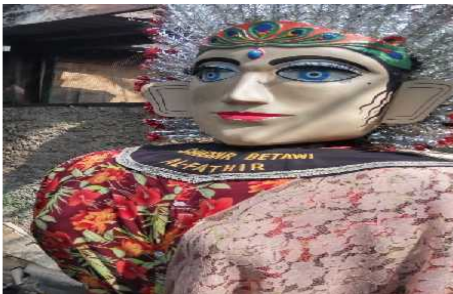
Figure 3. 29. “Ratu” Ondel-Ondel Product, Al Fathir Art Studio