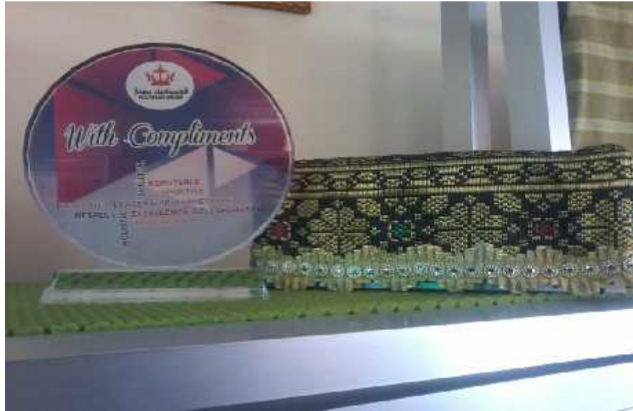
Figure 4. 86. Award from Brunei's Sultan for Rosmawey's Woven Products

The Rosmawey's efforts in maintaining its excellent services and quality of their products for years have won an award from the kingdom as a company that always maintains its reputation and market share and is regarded to demonstrate good leadership. The award, product display, and production process are presented in Figure 4. 86., Figure 4. 87., and figure 4. 88.