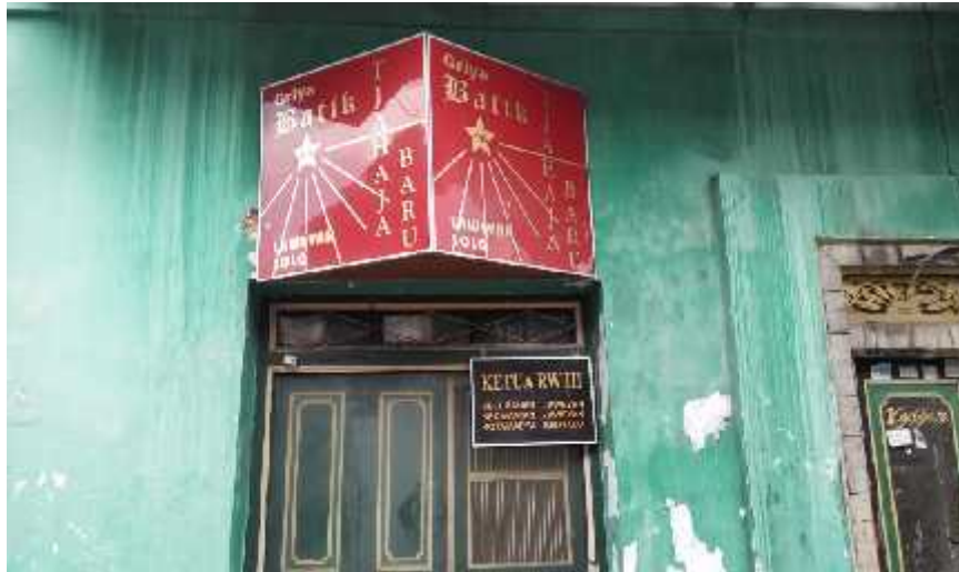
Figure 3. 19. Batik Tjahaja, Laweyan Batik Village, Solo