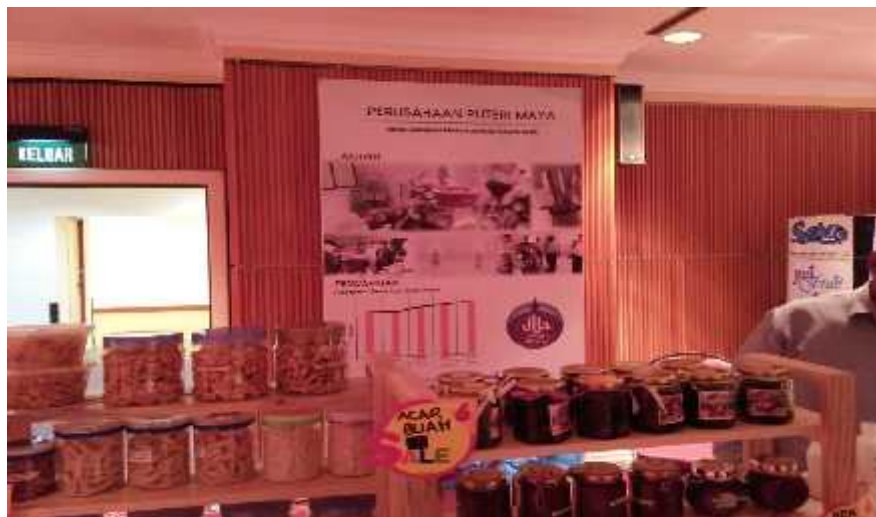
Figure 4.78. Stand of Traditional Cake Production