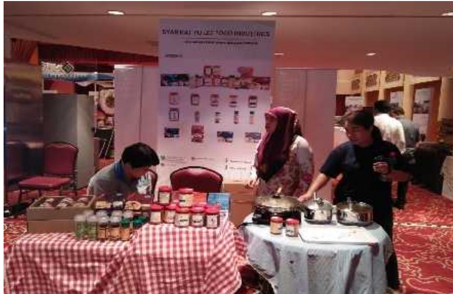
Figure 4.77. Stand of Red Meat