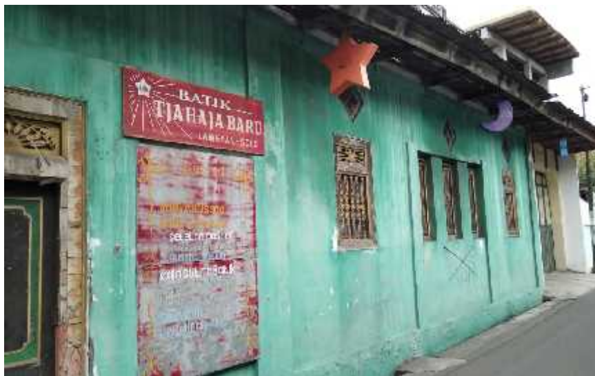
Figure 3. 20. Batik Tjahaja, Laweyan Batik Village, Solo

The increase in batik production and distribution led to the modernization phase of its production equipment, resulting in a rise in the wealth of Laweyan batik merchants. 1930s Dutch-style manors, replacing old village houses made of teak boards, characterized by jepara carvings. The wealth of Laweyan's merchants collected in the visuals of the gedongan house can be