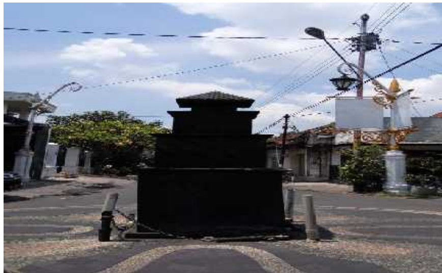
Figure 3. 18. Laweyan Batik Village Monumen, Solo

During the Kingdom administration, the Laweyan community consisted of 2 regions: West Laweyan and East Laweyan, separated by the Laweyan River. The characteristics of the population are very different. Residents of Laweyan Barat, in economic and cultural matters, have more to do with the facilities provided by the king. On the other side, the residents of Laweyan Timur, which is inhabited by a large number of traders and batik entrepreneurs, focus more on Laweyan (dead) market. The dead market is now the Lor (North) and Kidul (South) market village.