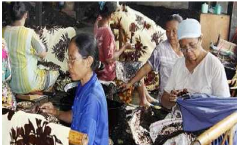
Figure 3. 2. Pekalongan Batik Craftsmen on Their Activities

The process of the batik industry in Pekalongan City takes place with a subcontracting contract pattern. Entrepreneurs seeking for orders look for production-level entrepreneurs who have networks with order buyer. This networking greatly determines the success of goods ordering transactions. The owner of the order usually has a record of the performance of prospective relations through their previous contracts. With the pattern of order, which is then done in the sub-order or sub-contract, some orders are produced at the batik tenant's house and some others take it home to be produced at home (putting out system). This is what makes a lot of residents in all corners of Pekalongan City work on batik sanggan (batik production workshop), whether it is nyolet or njahit (sewing) in their homes. In practice, subcontracting can occur vertically or horizontally. This is related to who gives capital such as the needed mori cloth and dye and thread. As stated by Beneria and Roldan (1987) that based on the supply of raw materials, horizontal subcontracting or horizontal subcontracting does not require the order giver or customer to provide the raw materials. While in vertical subcontracting, the order giver must provide the raw material needed.. 10