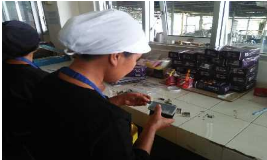
Figure 3. 61. Process of Making BakpiaTelo

In 1984, the former SekjenKontakTanidanNelayan (KTNA) in 2000 established Sentra PengembanganAgrobisnisTerpadu (SPAT). SPAT conducts six activities routinely, starting from integrated education and training centers, data and information centers, study centers and strategies for village development movements, centers for developing appropriate technologies, centers for investment and financing studies, and agribusiness terminals. Then on an area of 8,000 square meters on the border of Pasuruan and Malang Regency, he built an agribusiness terminal consisting of the SPAT Secretariat Office, showrooms for decorative plants, hydroponics, and fertilizer.