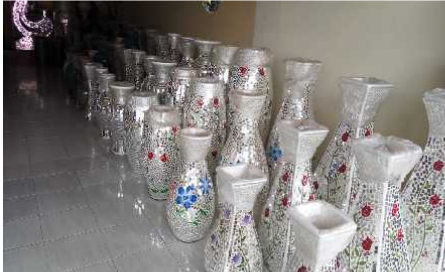
Figure 3. 44. Modern Pottery Crafts that Ready for Export

Business competition and consumer demand are also experienced by ceramic craftsmen. Innovation is the mainstay of this business, such as combination of materials, ornaments, designs and shape of product. For example is the combination of glass pieces which produce mosaics are in great demand by consumers. The appearance of the product becomes more elegant and modern.