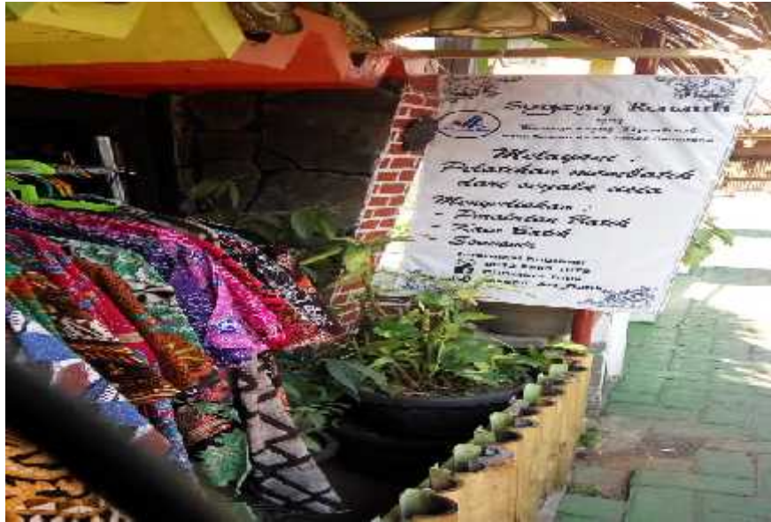
Figure 3. 11. Jenis Pelayanan di Kampung Batik Djadoel Rejomulyo, Semarang

The batik entrepreneurs in Djadoel village, Semarang are not only having tendencies on economics, but also in social and education about batik. This is evidenced by the batik making practices for visitors or tourists both from within and outside of the country. Apart from entrepreneurs, the Semarang city government is also concerned about the development of Semarangan batik, namely by participating in a series of batik exhibitions held in various cities.