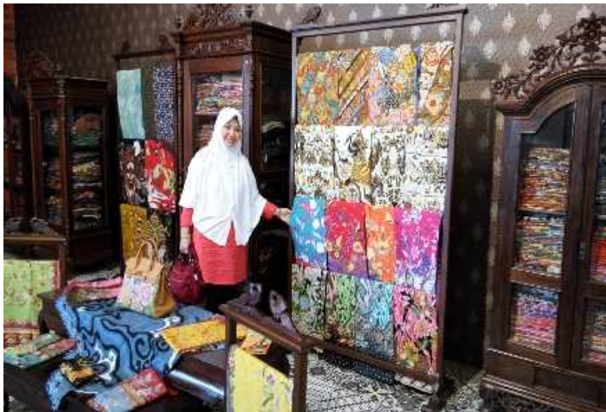
Figure 3. 57. Various Patterns of Batik Trusmi