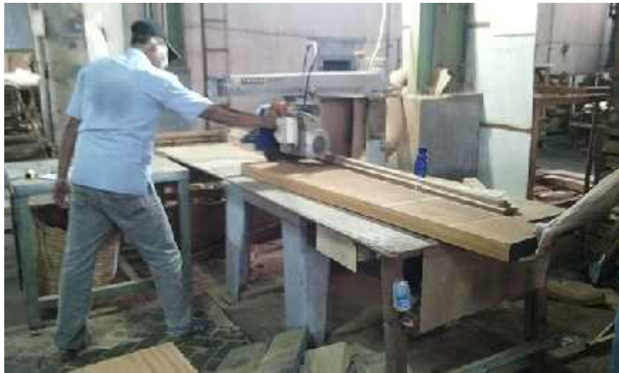
Figure 3. 39. Wood Smoothing Process

company. It's about 17 months managing the joint venture company, then he founded CV. named CV. Manora Karya Utama, with 100% capital from himself, while joining PT. BEVEJE, a PMA and Arredo Gi were only buying agents until 2010. Furthermore, he joined PT. Avant Garde until 2014. In 2014 he returned from Jakarta and opened a retail furniture store in Jepara. In this condition he only served a number of loyal buyers, and even this was subcontracting.