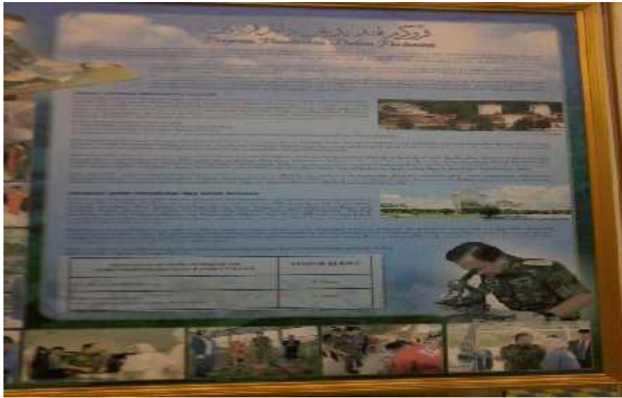
Figure 4. 65. The Sultan's Policy in Economic Activities

Figure 65.3. shows that the Brunei government policy also involves the country's higher education sector such as designing an education program in a farming sector. For instance, University of Islam Sultan Syarif (UNISSA) students also take entrepreneurship courses and manage business groups to be mentored by the lecturers to train their entrepreneurial skills. This student business group is supervised starting from the planning, production, to sales processes.