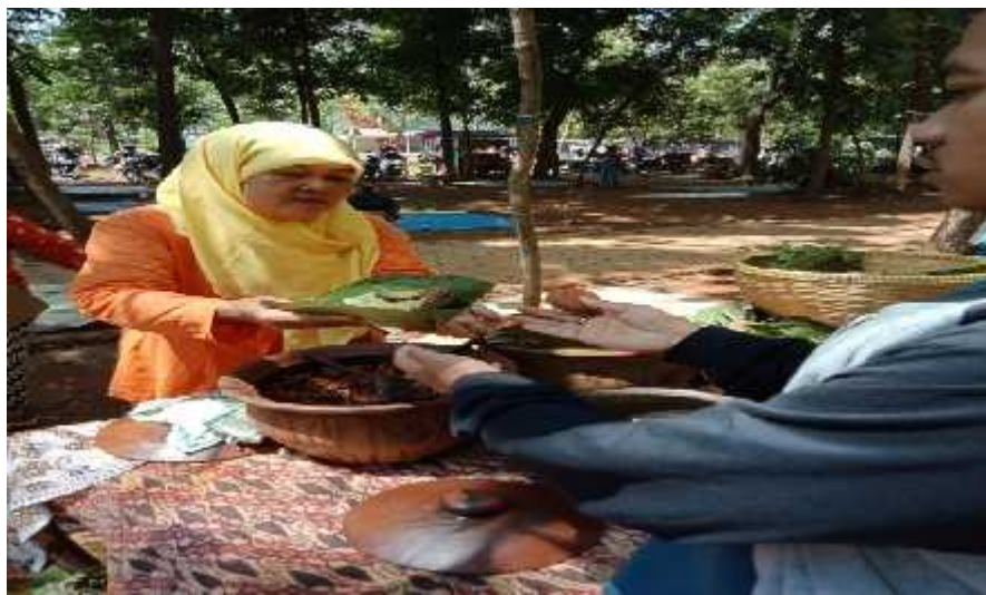
Figure 3. 13. Minggon Jati Activities, Batang Regency

Batang Regency, up to 2018, encourages local entrepreneurs to develop culture-based businesses. One of them is the development of Djadoel culinary tourism located in the community attraction area of Batang Regency. This Djadoel market is held weekly on Sundays. It is called Minggon Jati, because this tourism area is located in a community park area that is overgrown with teak trees ( Jati is Javanese word for teak). This condition is very supportive for the people's culinary market.