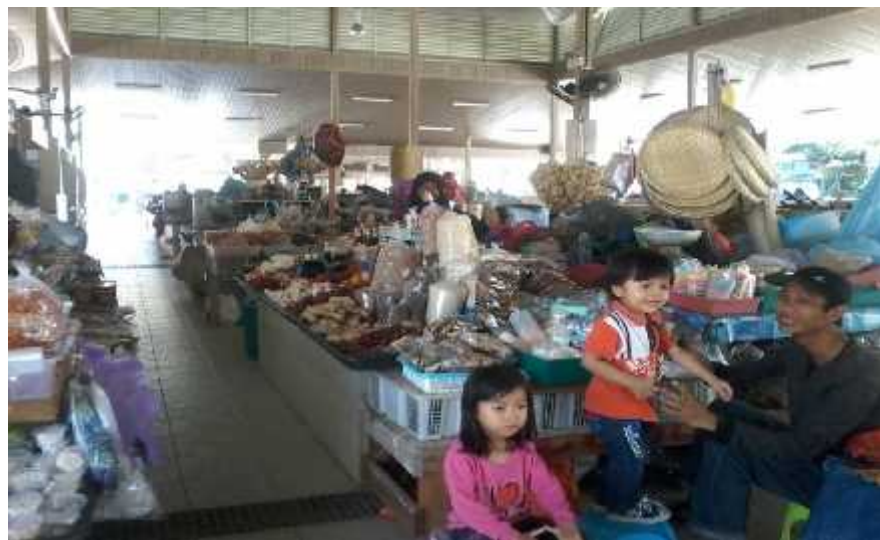
Figure 4. 91. Handcrafts at KianggehMarket

More interestingly, this market provides not only various cakes, but also household goods made from bamboo and sago palm leaves. Traditional spices are always available there. There are male and female sellers who frequently take care of children while doing their job so that the atmosphere in this market becomes even more crowded.