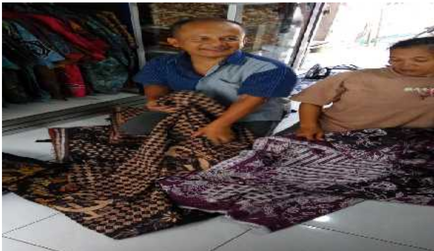
Figure 3. 25. Laweyan Batik Business Activity

In the Laweyan batik company, there are a large number of male workers, as stampers or coolies. Female workers are only few, because the workforce is limited to being employed as canting laborers or batik workers. There are times when these brokers have special skills as fine writing batik, but because the number of these products is very small when compared to stamped (cap) batik, their employers do not consider the presence of these batik artists as important in Laweyan companies. Therefore they were not treated as masons, but as laborers with lower salaries compared to stampers. This situation can also