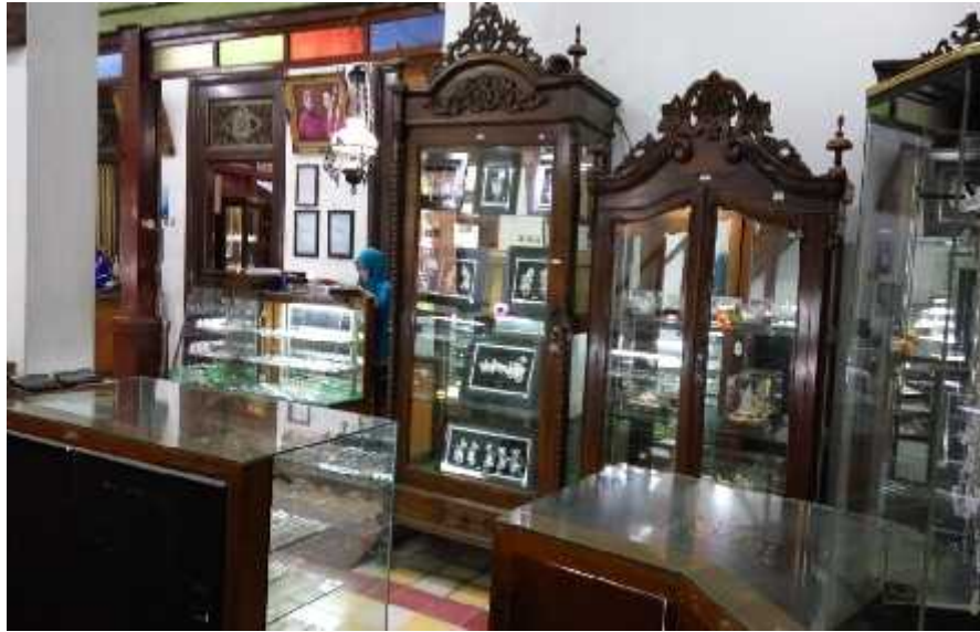
Figure 3. 52. Silver Crafts Display Room