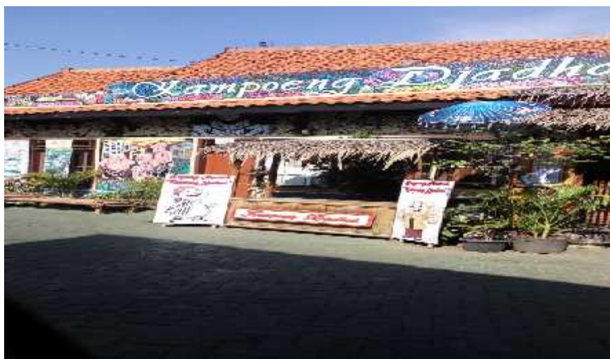
Figure 3. 8. Kampung Batik Djadoel Rejomulyo, Semarang

Semarang City has a craft center as well as an industry that is the community's pride, namely the batik center. The attention of the community has led to the awareness of batik making as a culture identity especially in Kampung Djadoel Rejomulyo, Semarang. The seriousness of preserving the batik business that has been going on for generations is manifested in the community's vision and mission.