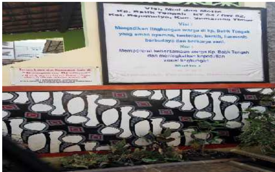
Figure 3. 9. Kampung Batik Djadoel Rejomulyo, Semarang