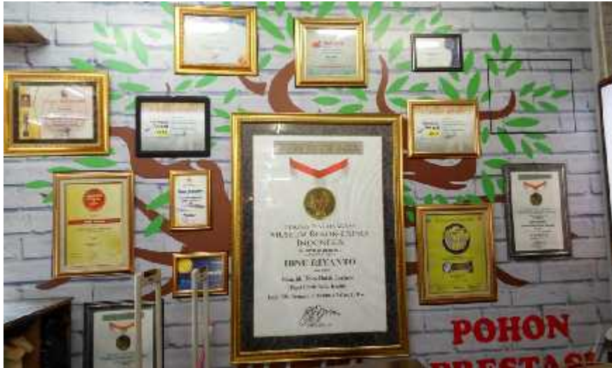
Figure 3. 56. Some Records Owned by Trusmi Batik Centre