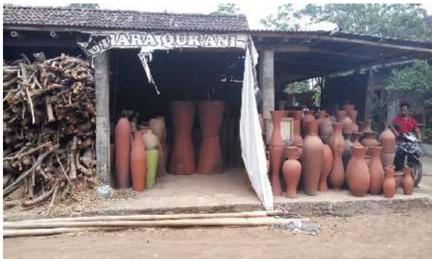
Figure 3. 45. Pottery Burning Room