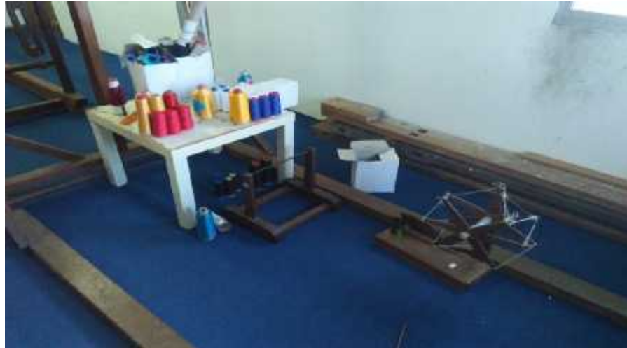
Figure 4. 84. Japanese Yarn for Weaving Production

The Rosmawey's weaving company recruits lots of workers from Indonesia, especially from Sambas. It is due to the consideration of weaving culture and similar weaving skills. Thus, this company does not need to strive for training them in weaving skills that contributes to the production efficiency. Likewise, the workers master not only the weaving skills, but also customer services. They are also skillful to explain prices to prospective buyers.