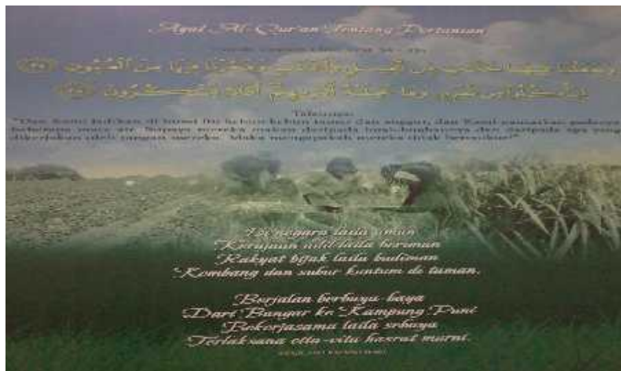
Figure 4. 74. Accommodation of Islamic Teaching in Surah Yasin Verse 34-35 by the Brunei Government for the Agriculture Sector