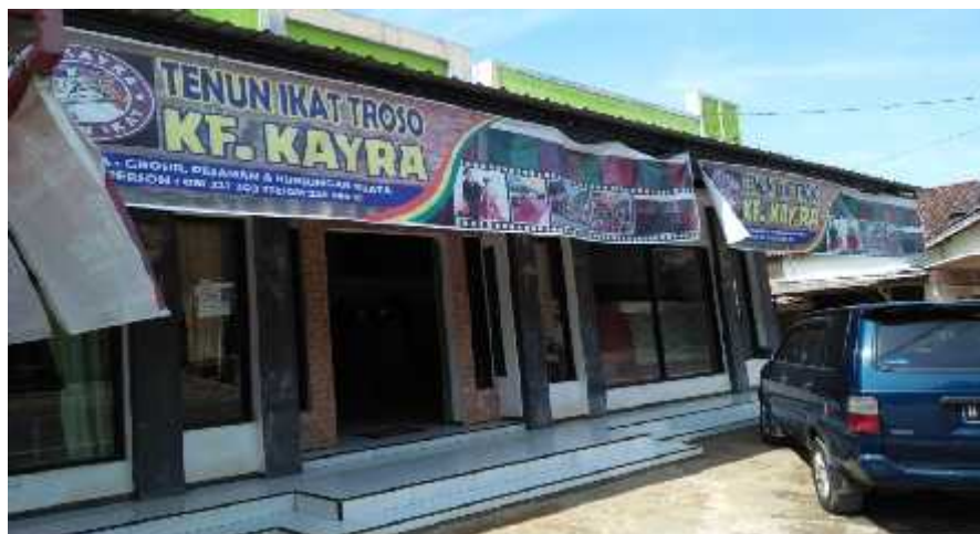
Figure 3. 32. Tenun Ikat Troso Production House, Kayra, Jepara