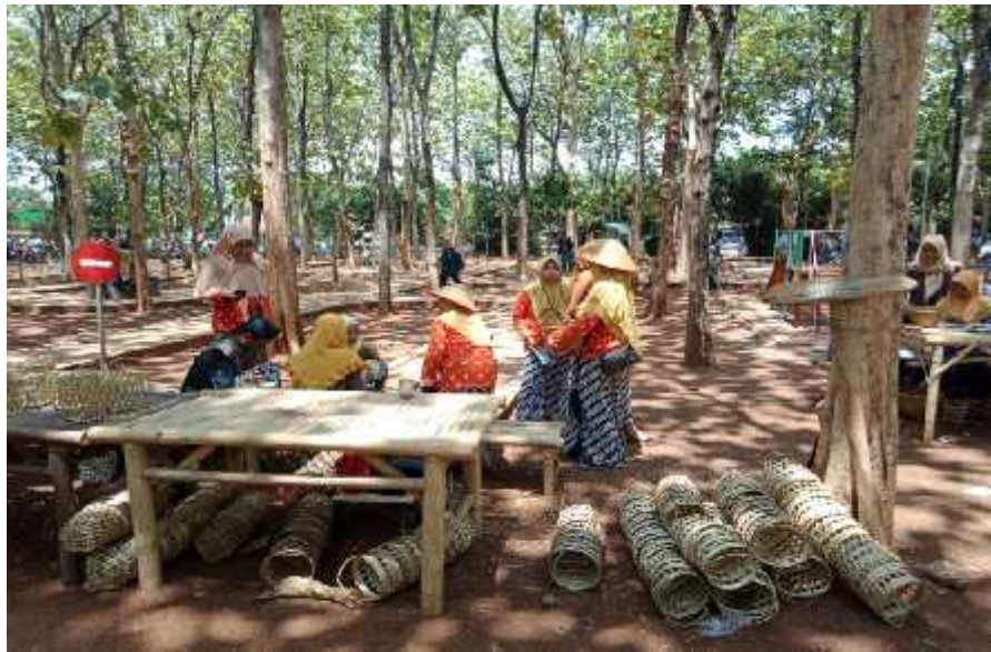
Figure 3. 16. Minggong Jati Activities, Batang Regency