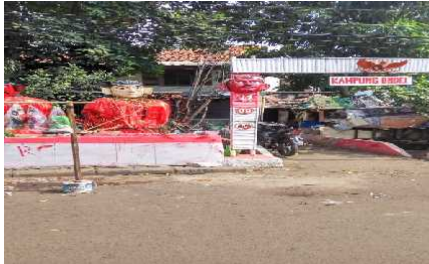
Figure 3. 26. Ondel-Ondel Sentra, Kampung Pulo, Central Jakarta

Ondel-ondel is a Jakarta icon that is very famous in Indonesia. Since 1980, someone named Mamet initiated the profile of the Balang and Si Ratu the Betawi doll over the world, from village to village to national and international levels. Kampung Pulo, Central Jakarta is a place known as the center for making ondel-ondel which is very legendary for Indonesia.