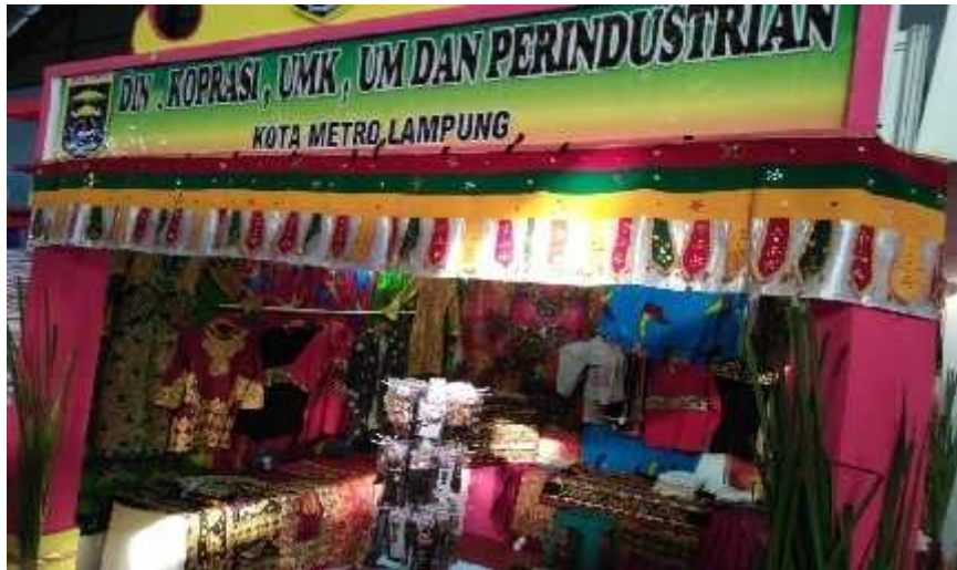
Figure 3. 7. 2018 International Batik Exhibition