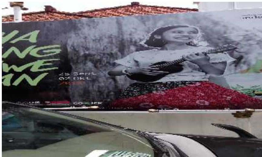
Figure 3. 21.

Batik and wealth, became the status symbol of the owner who obtained the title of Laweyan "merchant". Therefore they exaggeratedly show off their wealth in the eyes of the people. But not as many other people expected, the high and strong fence walls encircling every house in Laweyan, functioned not only to protect their wealth from bad people, but also to avoid the involvement of other people from knowing the economic interests of their company. They live in their independence which is always surrounded by the interests of money (wealth) and self-esteem (competition). The entrepreneurship traits of these entrepreneurs have influenced the economical attitude of life for Laweyan merchants. Therefore in their exclusive lives, people gave them impression as stingy person, who are only prioritizing their own interests.