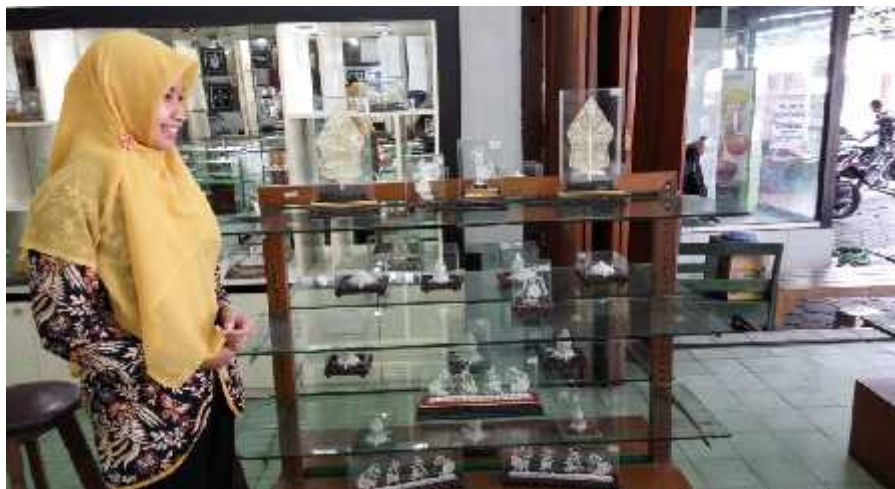
Figure 3. 53. Display Room with Guide