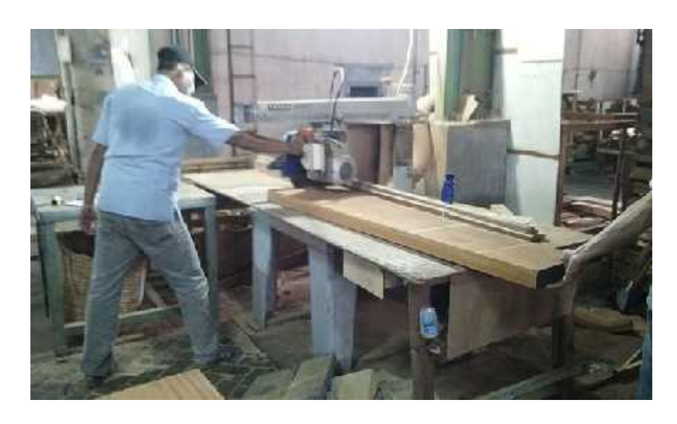
Figure 3. 39. Wood Smoothing Process

company. It's about 17 months managing the joint venture company, then he founded CV. named CV. Manora Karya Utama, with 100% capital from himself, while joining PT. BEVEJE, a PMA and Arredo Gi were only buying agents until 2010. Furthermore, he joined PT. Avant Garde until 2014. In 2014 he returned from Jakarta and opened a retail furniture store in Jepara. In this condition he only served a number of loyal buyers, and even this was subcontracting.