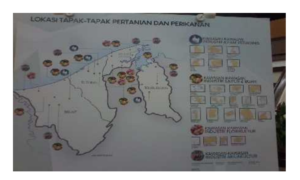
Figure 4.72. Identification of Agriculture and Fishery Sites, Brunei 2018

Brunei Darussalam has regularly held a wide array of exhibitions of various local products. It can be seen that the Sultan prioritizes the identification of income sources from the agriculture and fishery sectors. This priority is due to the fact that some food such as rice is still obtained from imports. The government identification is presented in Figure 4.72.