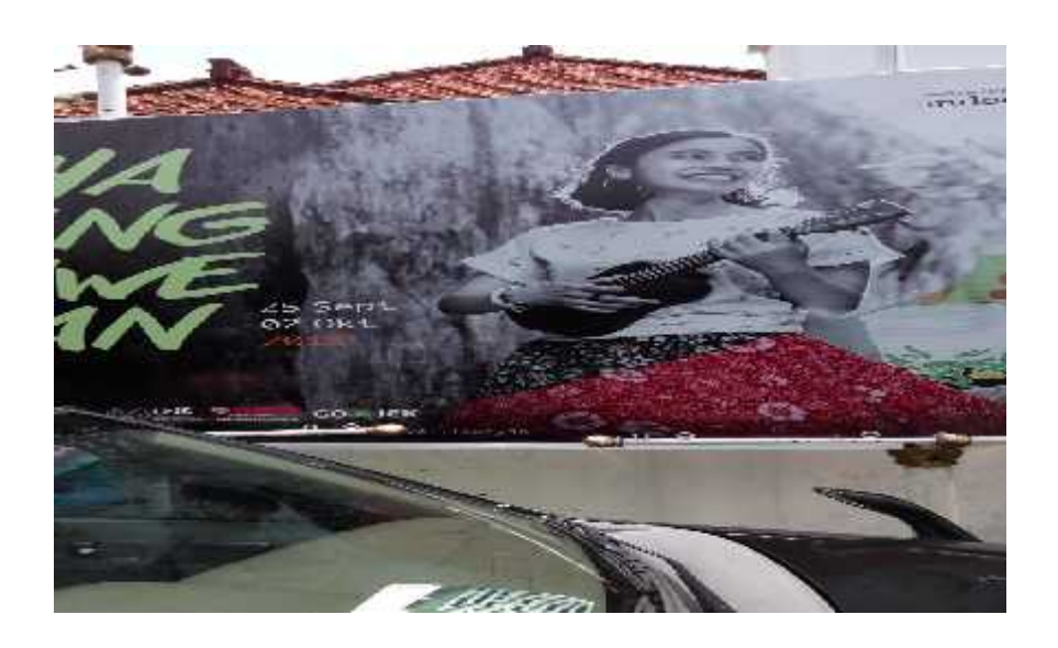
Figure 3. 21. Pekan Nyawang Laweyan Event, September 25th – October 2nd, 2018

Batik and wealth, became the status symbol of the owner who obtained the title of Laweyan "merchant". Therefore they exaggeratedly show off their wealth in the eyes of the people. But not as many other people expected, the high and strong fence walls encircling every house in Laweyan, functioned not only to protect their wealth from bad people, but also to avoid the involvement of other people from knowing the economic interests of their company. They live in their independence which is always surrounded by the interests of money (wealth) and self-esteem (competition). The entrepreneurship traits of these entrepreneurs have influenced the economical attitude of life for Laweyan merchants. Therefore in their exclusive lives, people gave them impression as stingy person, who are only prioritizing their own interests.