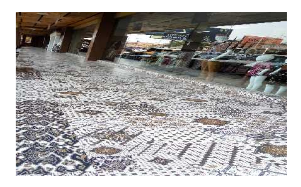
Figure 3. 55. The Use of Batik Pattern on the Floor

The media for batik is no longer bound for cloth only. The creativity of craftsmen to introduce batik to the public is growing rapidly. One of the media is on floor tiles. It gives different atmosphere for tourists while enter the center of making and selling batik in Cirebon. Besides, there are other already mediafor batik that has been introduced such as cloth, bags, jewelry, clothing, t-shirts, gloves, hats, bread / cakes, and so on. The production activities and trade transactions of Trusmi batik as one of the biggest batik icons are increasingly famous after the process of making copyright and recorded at MURI, Indonesia.