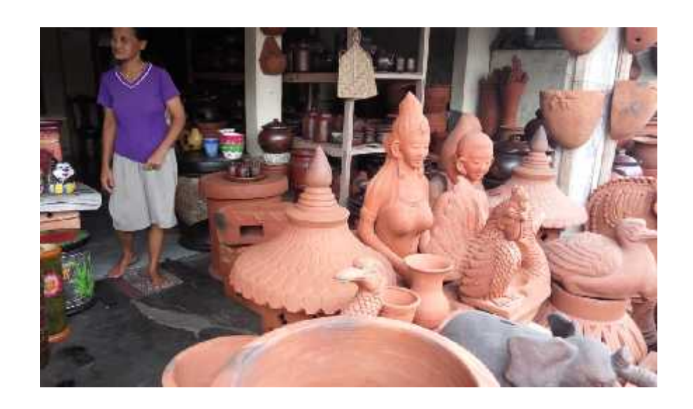
Figure 3. 42 Pottery Craft Shop, Kasongan, Bantul, Yogyakarta

Businesse that has been establishing for decades had experienced a variety of problems, start from capital issues, scarcity of clay, including the presence of factory products made from plastic which affected their business growth. However, they also have their own market share, namely antique collectors.