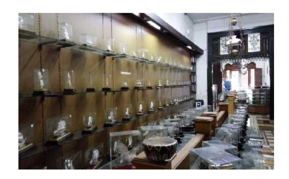
Figure 3. 50. Various Silver Crafts