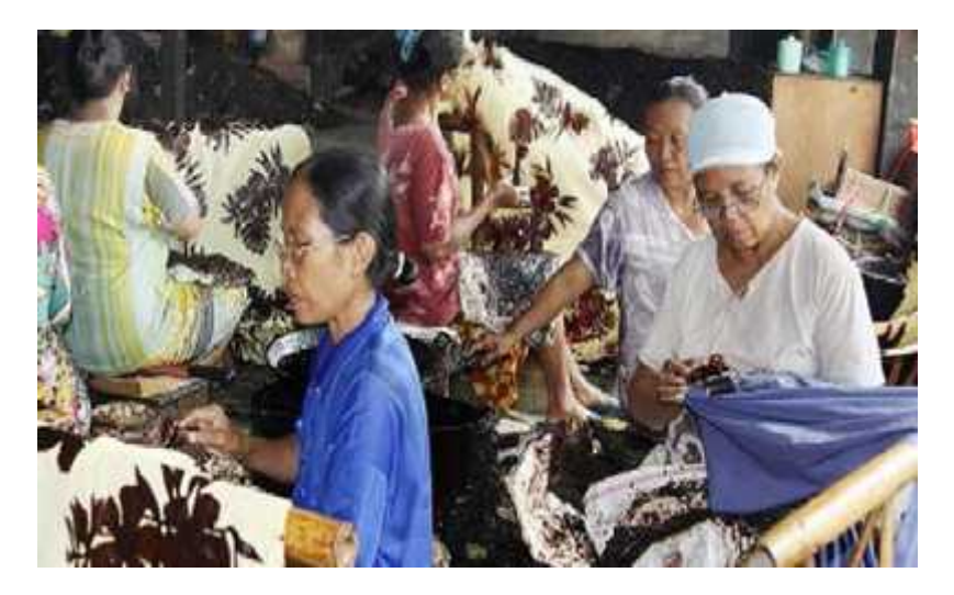
Figure 3. 2. Pekalongan Batik Craftsmen on Their Activities

The process of the batik industry in Pekalongan City takes place with a subcontracting contract pattern. Entrepreneurs seeking for orders look for production-level entrepreneurs who have networks with order buyer. This networking greatly determines the success of goods ordering transactions. The owner of the order usually has a record of the performance of prospective relations through their previous contracts. With the pattern of order, which is then done in the sub-order or sub-contract, some orders are produced at the batik tenant's house and some others take it home to be produced at home (putting out system). This is what makes a lot of residents in all corners of Pekalongan City work on batik sanggan (batik production workshop), whether it is nyolet or njahit (sewing) in their homes. In practice, subcontracting can occur vertically or horizontally. This is related to who gives capital such as the needed mori cloth and dye and thread. As stated by Beneria and Roldan (1987) that based on the supply of raw materials, horizontal subcontracting or horizontal subcontracting does not require the order giver or customer to provide the raw materials. While in vertical subcontracting, the order giver must provide the raw material needed..<sup>10</sup>