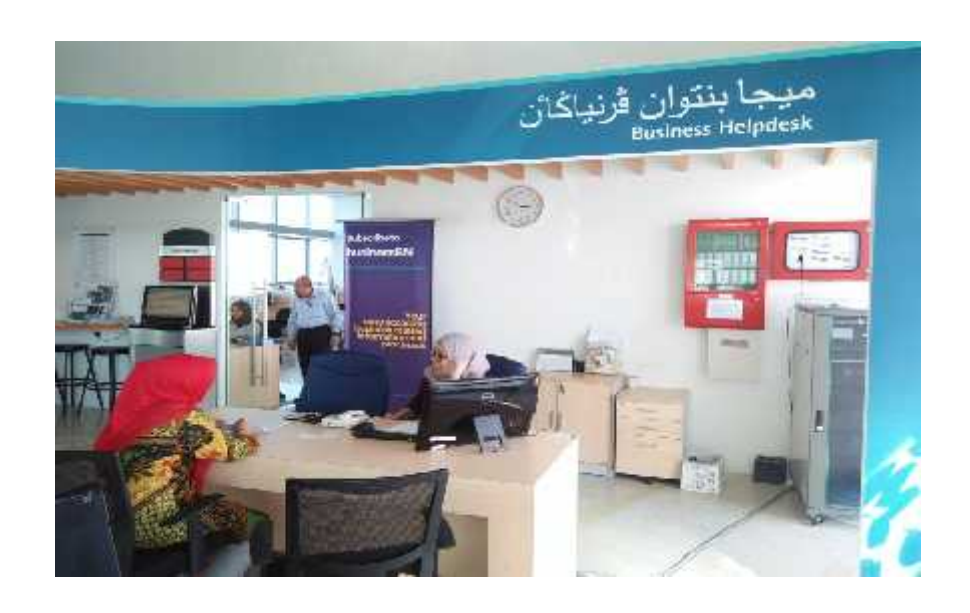
Figure 4. 69. DARe Services/Counseling