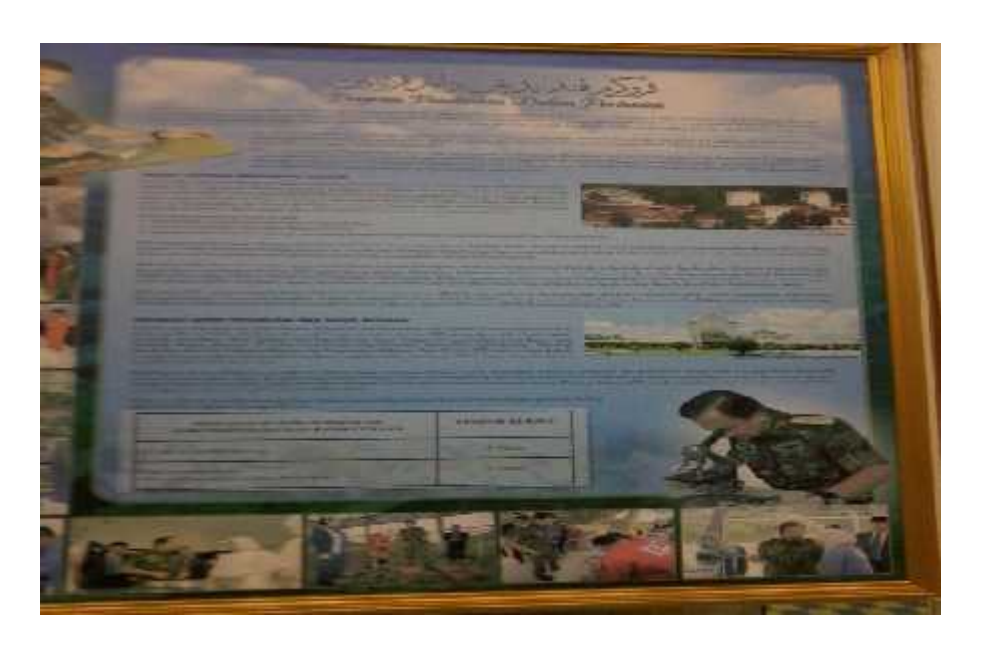
Figure 4. 65. The Sultan's Policy in Economic Activities

Figure 65.3. shows that the Brunei government policy also involves the country's higher education sector such as designing an education program in a farming sector. For instance, University of Islam Sultan Syarif (UNISSA) students also take entrepreneurship courses and manage business groups to be mentored by the lecturers to train their entrepreneurial skills. This student business group is supervised starting from the planning, production, to sales processes.