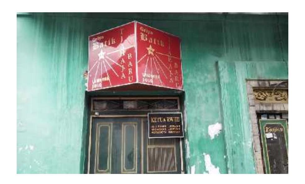
Figure 3. 19. Batik Tjahaja, Laweyan Batik Village, Solo