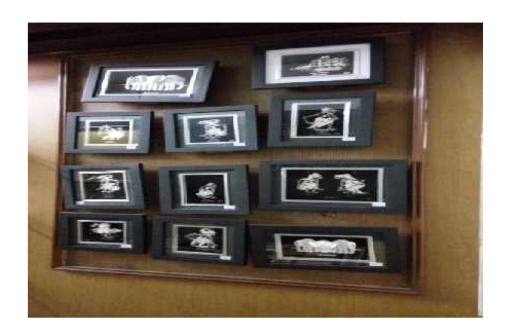
Figure 3. 51. Various Silver Puppet Handicrafts