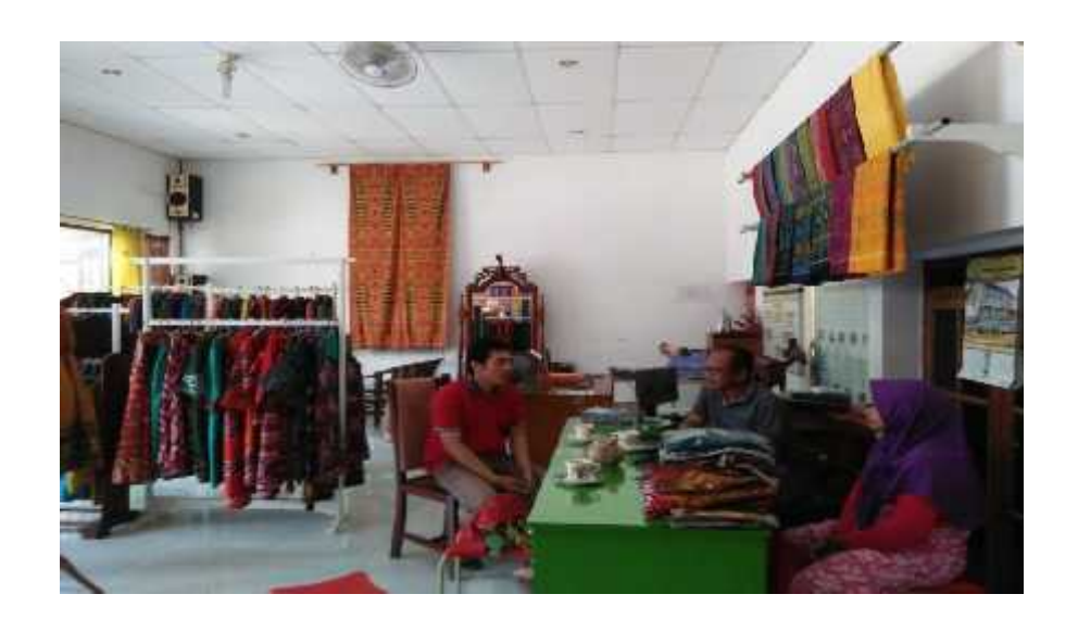
Figure 3. 38. Display Room and TrosoKayraJepara Woven Fabric Store

Seen from its market share, craftsmen prefer a comfort zone. As done by Ampel Jaya's weaving business which only focuses on Bali with its Balinese weaving products, and KF Kayra whichits main focus is also on Bali with the same products even though KF Kayra is also still producing other products on demand. Although those two UKMs were together withTenun Limo were facilitated by Muria Kudus University for exhibitions in Thailand and Brunei. From those three SMEs, KF Kayra is the most often SMES that included in exhibitions by the Central Java Industry and Trade Cooperative Office, and also by PT Telkom because it is also a fostered partner of PT Telkom. Whereas the most diligent participants in the exhibition are Tenun Limo either facilitated or independently. Meanwhile, Ampel Jaya rarely joins exhibitions because Bali woven is the only focus for Bali market.