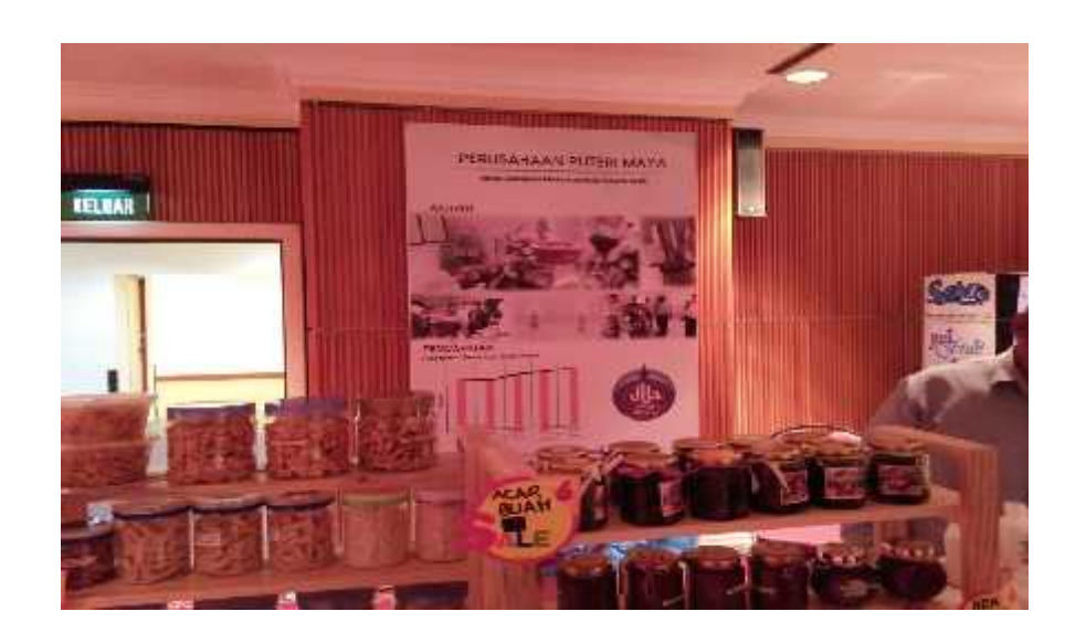
Figure 4.78. Stand of Traditional Cake Production