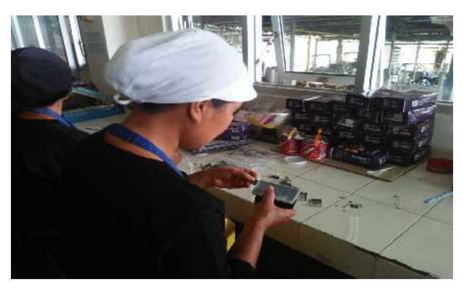
Figure 3. 61. Process of Making BakpiaTelo

In 1984, the former SekjenKontakTanidanNelayan (KTNA) in 2000 established Sentra PengembanganAgrobisnisTerpadu (SPAT). SPAT conducts six activities routinely, starting from integrated education and training centers, data and information centers, study centers and strategies for village development movements, centers for developing appropriate technologies, centers for investment and financing studies, and agribusiness terminals. Then on an area of 8,000 square meters on the border of Pasuruan and Malang Regency, he built an agribusiness terminal consisting of the SPAT Secretariat Office, showrooms for decorative plants, hydroponics, and fertilizer.