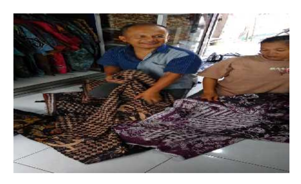
Figure 3. 25. Laweyan Batik Business Activity

In the Laweyan batik company, there are a large number of male workers, as stampers or coolies. Female workers are only few, because the workforce is limited to being employed as canting laborers or batik workers. There are times when these brokers have special skills as fine writing batik, but because the number of these products is very small when compared to stamped (cap) batik, their employers do not consider the presence of these batik artists as important in Laweyan companies. Therefore they were not treated as masons, but as laborers with lower salaries compared to stampers. This situation can also