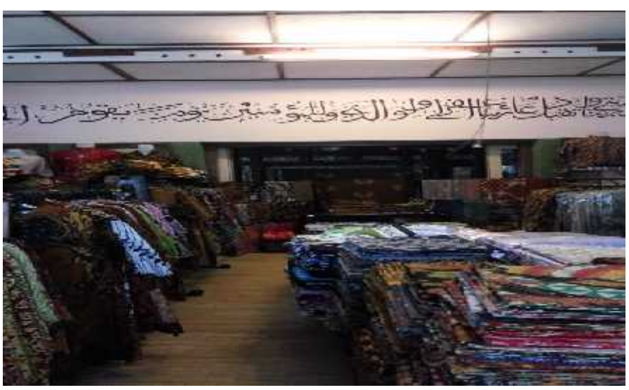
Figure 3. 23. Religiosity of Batik Laweyan Entrepreneurs

among businessmen families, are usually characteristic of what is called the kinship relationship of Laweyan merchants. This situation shows the existence of a high level of mobility in the economic attitudes of the merchants, so that the individualist nature is stronger in coloring their lifestyle. That is why they see the need to understand their environmental conditions, then decide to build luxurious building houses as an embodiment of family pride. Yet on other occasions, the value of social status is closed by large walls themselves, for their economic interests.