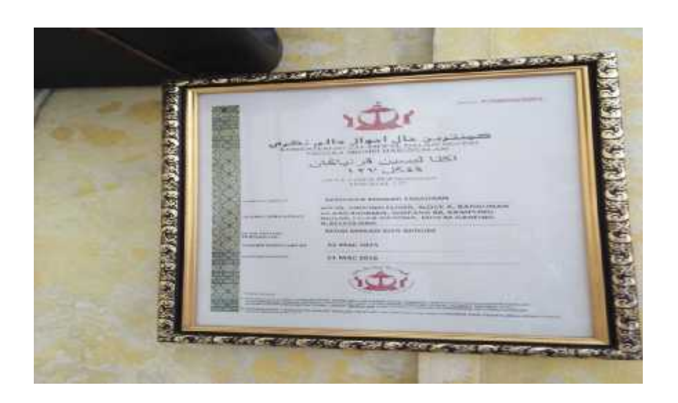
Figure 4.77. Halal Certificate Issued by the MUIB

Furthermore, Figure 4.77. demonstrates that the government of Brunei Darussalam assures halal products and consumer safety by providing halal certificates. It is done to perform government's obligation for giving a sense of security to the public and support the development of the Bruneians' businesses. Likewise, it is because halal product assurance is expected to be able to increase tourist visits.