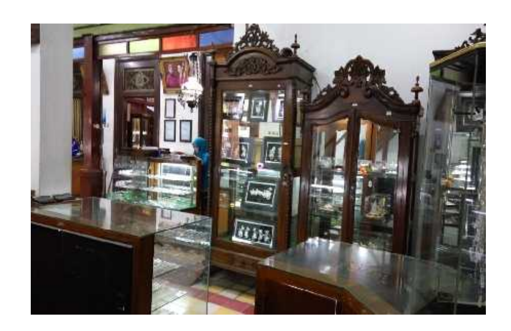
Figure 3. 52. Silver Crafts Display Room