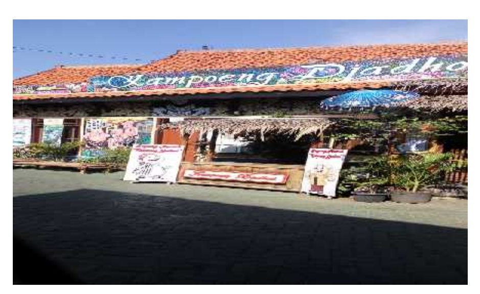
Figure 3. 8. Kampung Batik Djadoel Rejomulyo, Semarang

Semarang City has a craft center as well as an industry that is the community's pride, namely the batik center. The attention of the community has led to the awareness of batik making as a culture identity especially in Kampung Djadoel Rejomulyo, Semarang. The seriousness of preserving the batik business that has been going on for generations is manifested in the community's vision and mission.