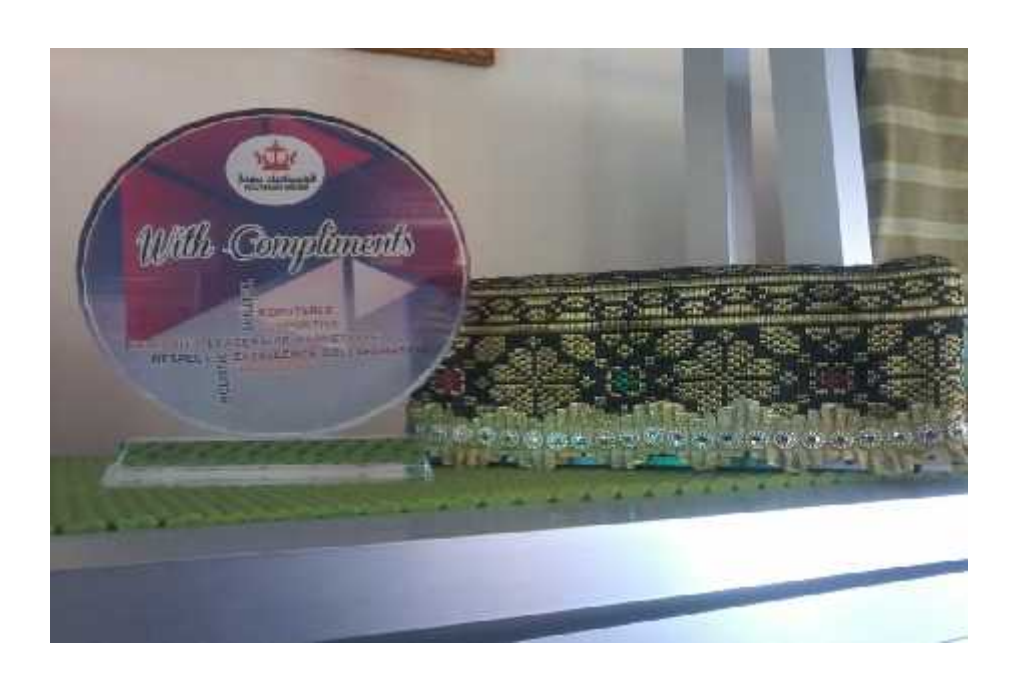
Figure 4. 86. Award from Brunei's Sultan for Rosmawey's Woven Products

The Rosmawey's efforts in maintaining its excellent services and quality of their products for years have won an award from the kingdom as a company that always maintains its reputation and market share and is regarded to demonstrate good leadership. The award, product display, and production process are presented in Figure 4. 86., Figure 4. 87., and figure 4. 88.