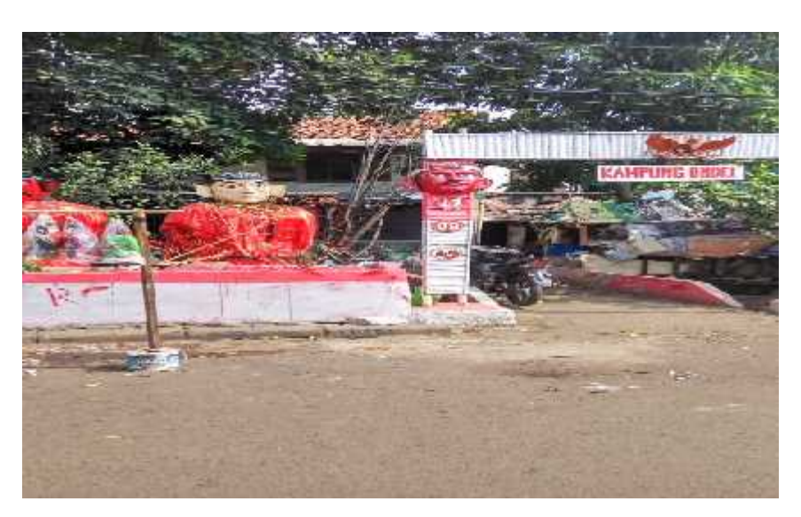
Figure 3. 26. Ondel-Ondel Sentra, Kampung Pulo, Central Jakarta

Ondel-ondel is a Jakarta icon that is very famous in Indonesia. Since 1980, someone named Mamet initiated the profile of the Balang and Si Ratu the Betawi doll over the world, from village to village to national and international levels. Kampung Pulo, Central Jakarta is a place known as the center for making ondel-ondel which is very legendary for Indonesia.