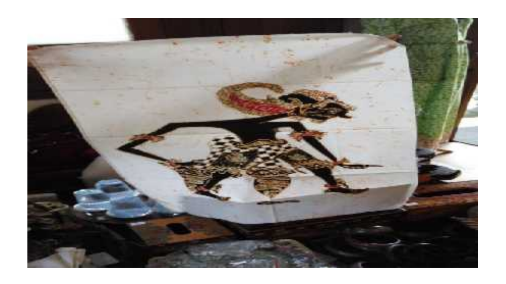
Figure 3. 24. Batik Laweyan Wayang Painting Creativity