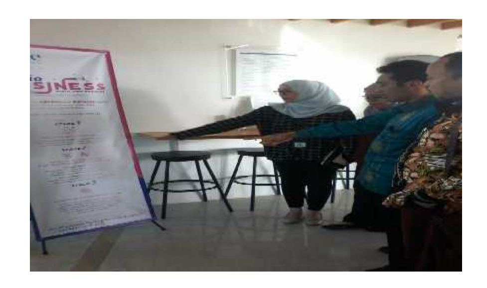
Figure 4. 70. Presentation by the DARe Officer on Startup Business