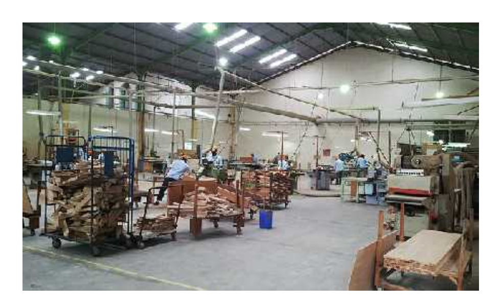
Figure 3. 40. Wood Cutting Room