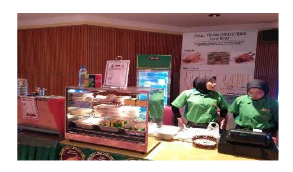
Figure 4. 76. Stand of Processed Products Made of Chicken Meat