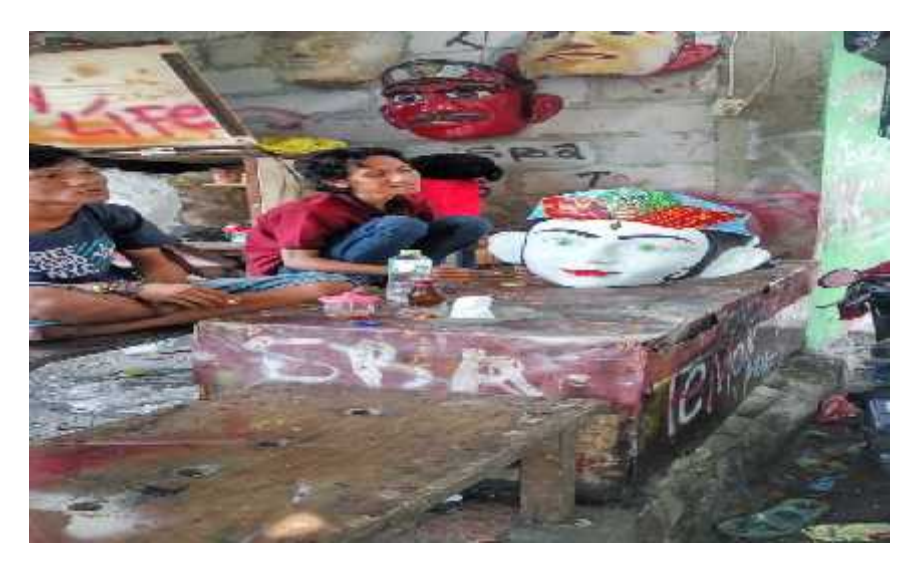
Figure 3. 27. Al Fathir Betawi Ondel-Ondel Art Workshop activity

but by using fiber which is considered more practical. The difference in material between used paper compared to fiber is very influential on the quality of the ondel-ondel produced. Quality made from fiber is smoother, easier to paint, and durable.