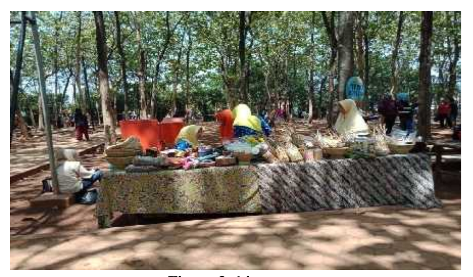
Figure 3. 14. Minggon Jati Activities, Batang Regency