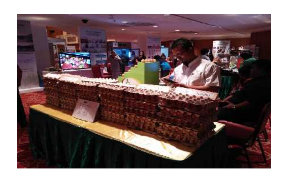
Figure 4. 75. Stand of Poultry Farming and Egg Production