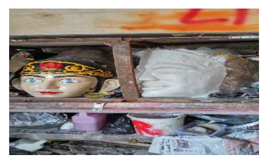
Figure 3. 31. Ondel-Ondel Reparation Workshop, Al Fathir Art Studio

The production of ondel-ondel also requires persistence and patience. Even so, even though their only capital is observation, most craftsmen have been able to do it. They generally do self-taught in the learning process of making ondel-ondel. There are no specific instructors or foremen, they usually remind each other if one of the craftsmen makes a mistake or there is a lack in making ondel-ondel.