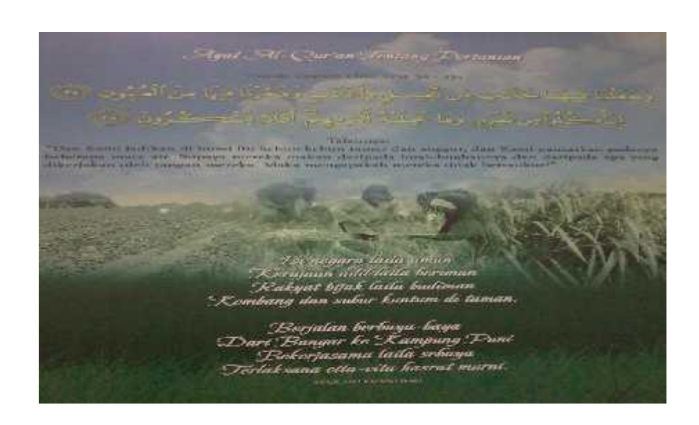
Figure 4. 74. Accommodation of Islamic Teaching in Surah Yasin Verse 34-35 by the Brunei Government for the Agriculture Sector