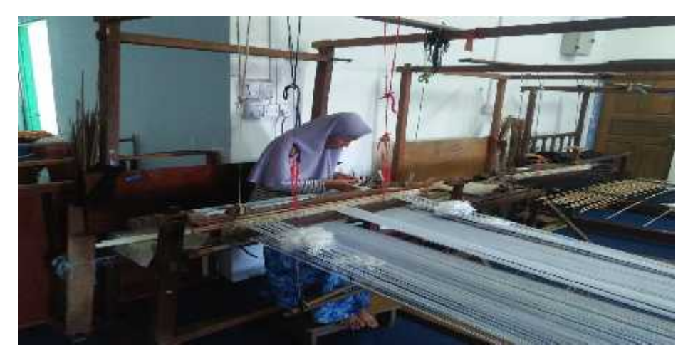
Figure 4. 88. Process of Weaving at Rosmawey