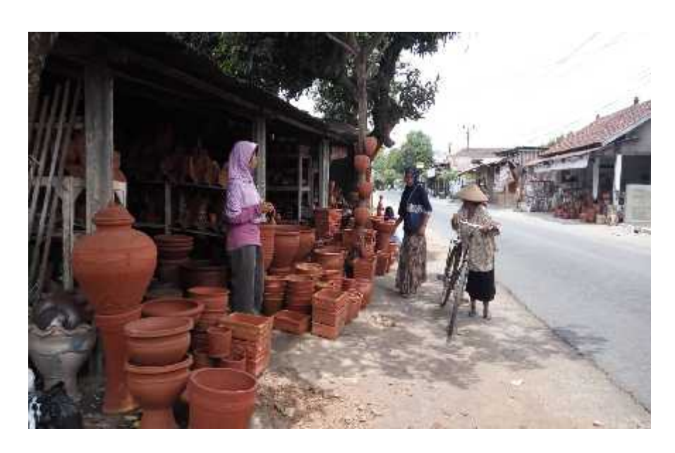
Figure 3. 43. Pottery Sale and Purchase Activities, Kasongan, Bantul, Yogyakarta