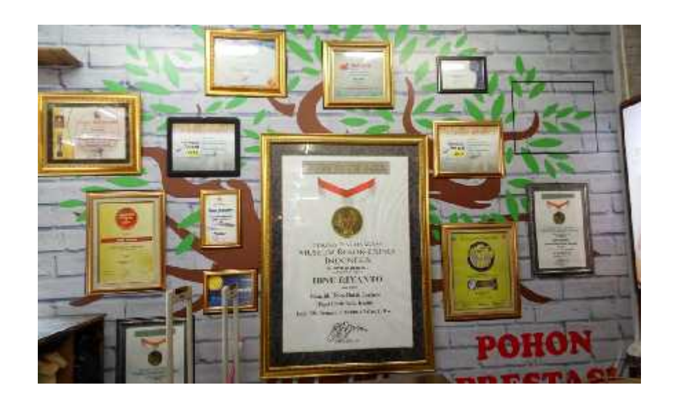
Figure 3. 56. Some Records Owned by Trusmi Batik Centre