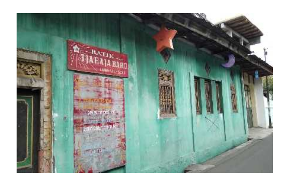
Figure 3. 20. Batik Tjahaja, Laweyan Batik Village, Solo

The increase in batik production and distribution led to the modernization phase of its production equipment, resulting in a rise in the wealth of Laweyan batik merchants. 1930s Dutch-style manors, replacing old village houses made of teak boards, characterized by jepara carvings. The wealth of Laweyan's merchants collected in the visuals of the gedongan house can be