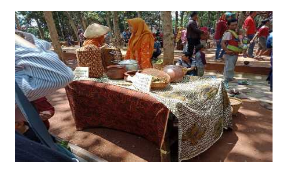
Figure 3. 17. Minggon Jati Activities, Batang Regency

Trading activities in the Minggon Jati area are multidimensional; the types of food and handicrafts sold, equipments used, clothings worn by the sellers and the atmosphere are all in old Javanese nuances. This breakthrough is a new icon of Batang Regency to attract tourists. This activity is very important for local micro traders, and has succeeded in encouraging small entrepreneurs to remain confident in running their businesses. This activity is very helpful for basket crafts, pottery, coconut shells and various other tools which until now still have their own market share.