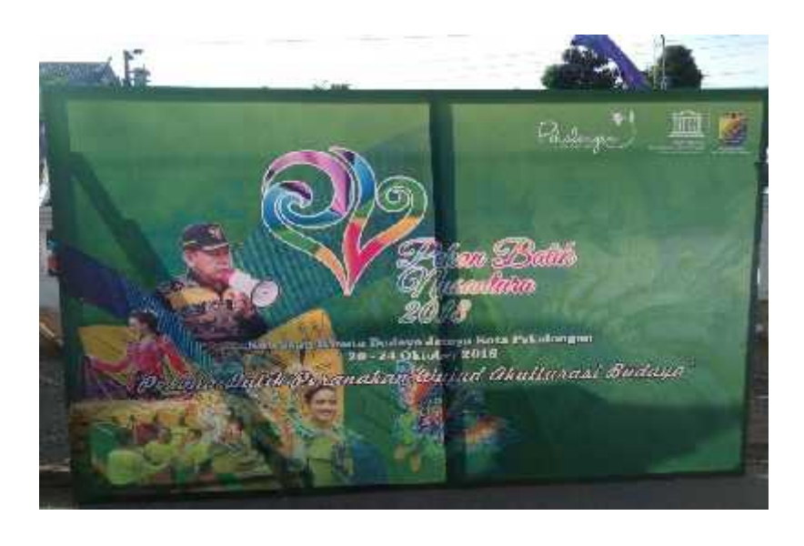
Figure 3. 1. Indonesian Batik Week

The geographical condition of Pekalongan City, which is on the northern coastline, has a lot of influence on a fairly extensive trading network. Not only that, the influence of communication with many ethnicities makes the character of Pekalongan people more egalitarian, both with natives, Arabs and Chinese, especially in trade activities. Even from the textile industry, ranging from traditional textile factories using only hand looms, to modern textile industries with machine-powered looms. In the same way, individuals who run retail businesses can be very diverse, from peddlers to stall or shop owners, many Chinese communities play roles in Java besides Sumatra. The production of coastal batik grew rapidly around the 1870s, supported by the progress of transportation in the presence of trains and steamers. Batik traders and producers try to meet diverse consumer tastes, which always demand new innovations. As a result, batik made along the coast, especially in Pekalongan, became very dynamic.<sup>9</sup>