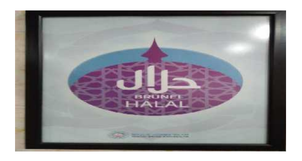
Figure 4.78. Halal Certificate Issued by the Brunei Darussalam Government

transaction. For this reason, the Sultan has applied the government policy regarding halal food. It is evidenced by the halal food control by issuing halal certificates that must be displayed in every business sites as it is shown in Figure 4. 78.