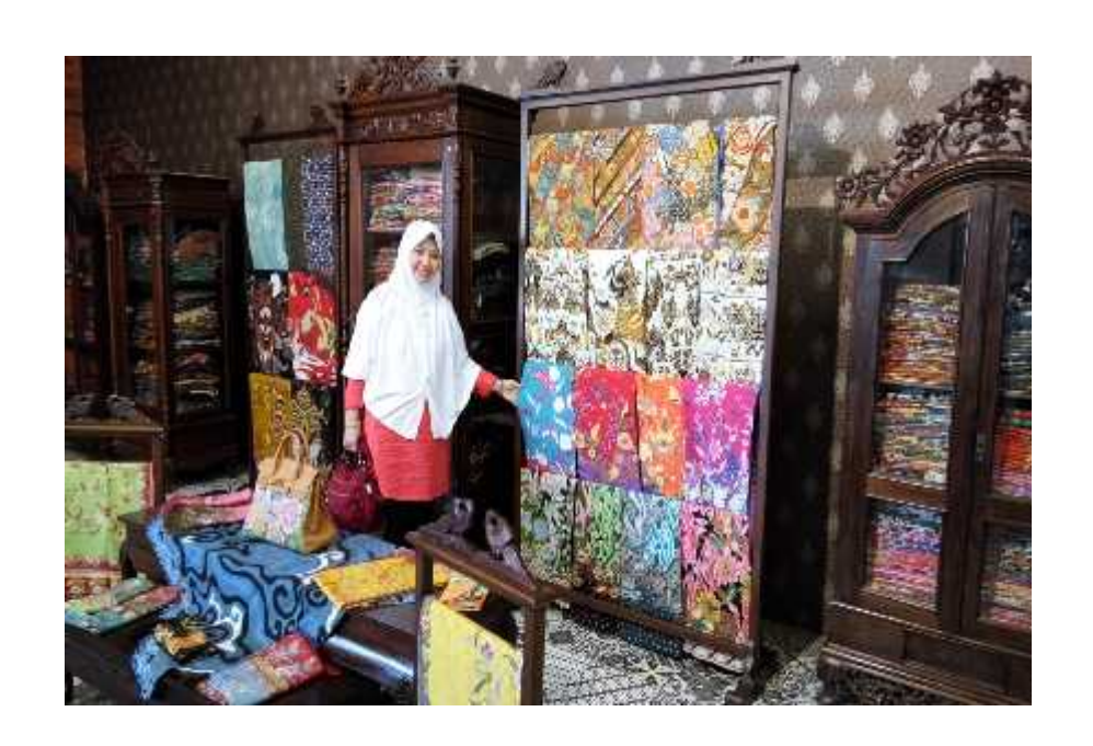
Figure 3. 57. Various Patterns of Batik Trusmi