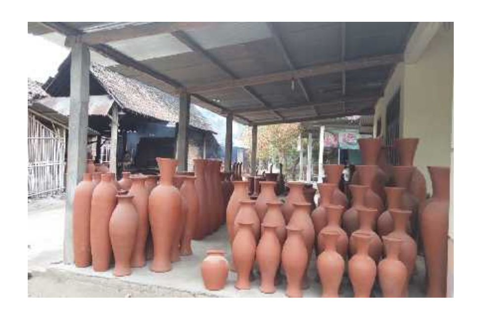
Figure 3. 49. Pottery that Ready to be Burn