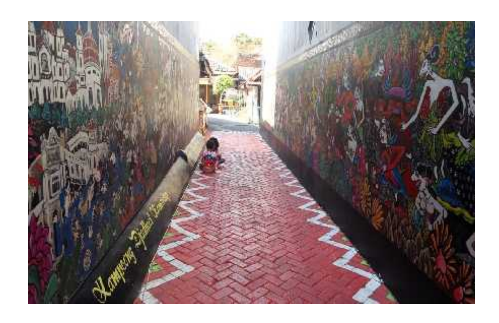
Figure 3. 10. Kampung Batik Djadoel Rejomulyo, Semarang