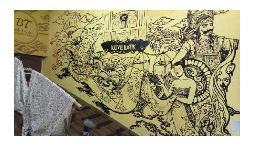
Figure 3. 60. Batik Painting on the Wall