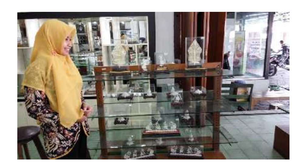
Figure 3. 53. Display Room with Guide