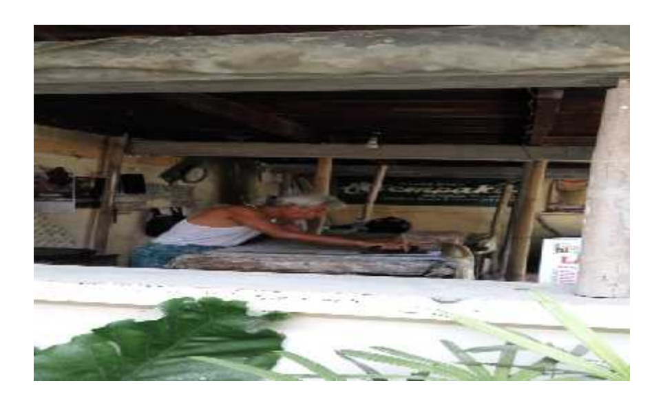
Figure 3. 22. Ngecap Batik Activity

Batik companies that can be found in Laweyan are entirely owned by Javanese people. The famous batik production from the area is printed batik cloth, which is relatively cheap. The term cheap has become a means of promotion that attracts the attention of consumers to leave fine batik, which is unproductive and expensive. The batik tulis production system has become long and slow. With the discovery of "cap" (stamp) system, there will be a change in industrial character that is parallel to the development of production nature from the "craft" "carpentry" system.