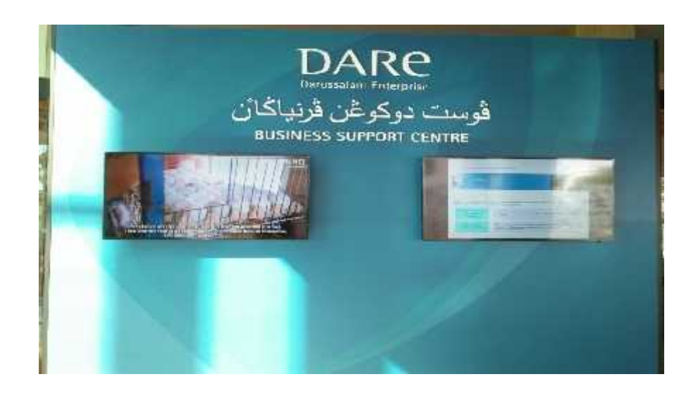
Figure 4. 67. DARe (Darussalam Enterprise)

There are, moreover, three main programs run by DARe, namely: 1) startup business with a 100-day mentoring period so that DARe is expected to be able to evaluate each business up to three times in a year, 2) Industry Business Academy, that is classical and free of charge, and 3) Micro Business Boot camp which has been already holding since January 2018. The Micro Business Boot camp opens to Bruneians and permanent residents and quarantine the participants in the natural environment. They participate in a one-week OBBD (Out Bound Brunei Darussalam) with a group consisting of 15 people and ranging from 18 to 40 years old.