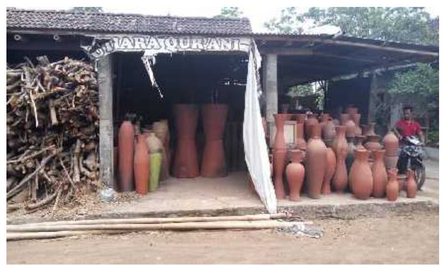
Figure 3. 45. Pottery Burning Room