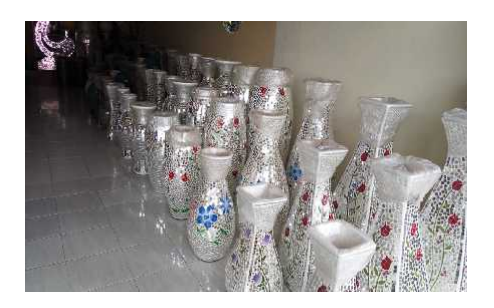
Figure 3. 44. Modern Pottery Crafts that Ready for Export

Business competition and consumer demand are also experienced by ceramic craftsmen. Innovation is the mainstay of this business, such as combination of materials, ornaments, designs and shape of product. For example is the combination of glass pieces which producemosaics are in great demand by consumers. The appearance of the product becomes more elegant and modern.