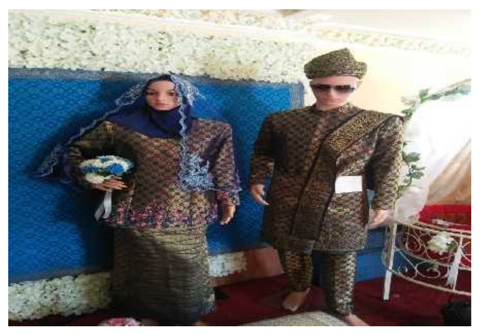
Figure 4.87. Display of Rosmawey's Woven Products

The Rosmawey's efforts in maintaining its excellent services and quality of their products for years have won an award from the kingdom as a company that always maintains its reputation and market share and is regarded to demonstrate good leadership. The award, product display, and production process are presented in Figure 4. 86., Figure 4. 87., and figure 4. 88.