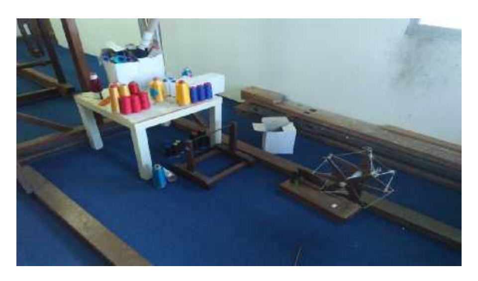
Figure 4. 84. Japanese Yarn forWeaving Production

The Rosmawey's weaving company recruits lots of workers from Indonesia, especially from Sambas. It is due to the consideration of weaving culture and similar weaving skills. Thus, this company does not need to strive for training them in weaving skills that contributes to the production efficiency. Likewise, the workers master not only the weaving skills, but also customer services. They are also skillful to explain prices to prospective buyers.