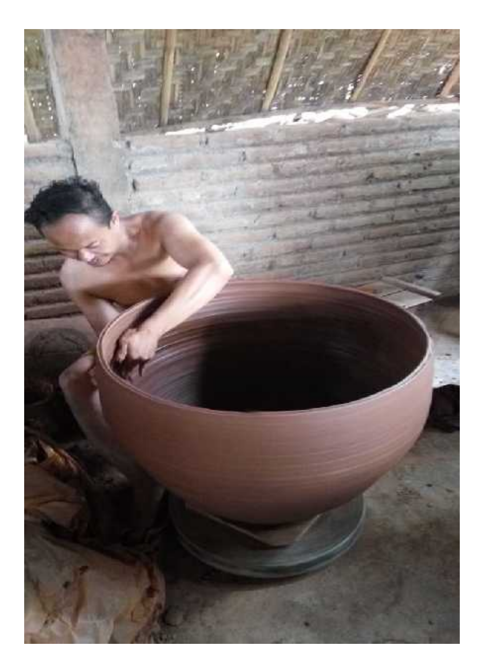
Figure 3. 48. The Process of Making a Big Vase