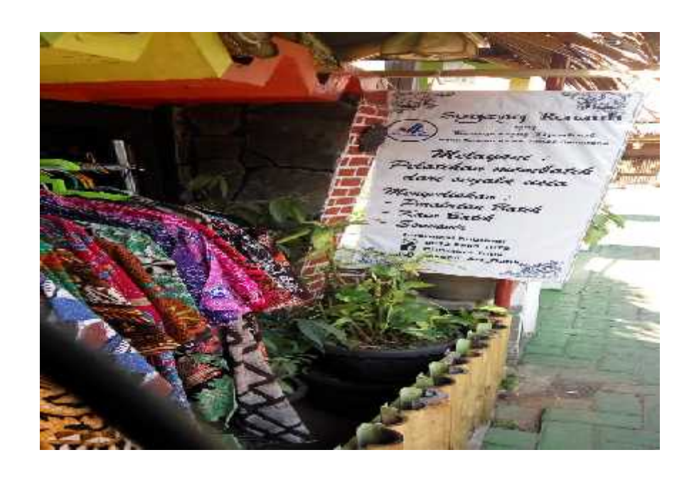
Figure 3. 11. Jenis Pelayanan di Kampun Batik Djadoel Rejomulyo, Semarang

The batik entrepreneurs in Djadoel village, Semarang are not only having tendencies on economics, but alson in social and education about batik. This is evidenced by the batik making practices for visitors or tourists both from within and outside of the country. Apart from entrepreneurs, the Semarang city government is also concerned about the development of Semarangan batik, namely by participating in a series of batik exhibitions held in various cities.