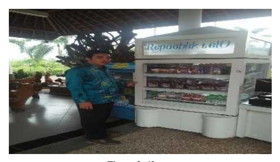
Figure 3. 62. Various Processed Telo

Since the previous government and continues until now. None of the policies are produced can reach what farmers need. Even political parties use farmers for their own benefit," said the man who won the 1996 National Level Pioneer Youth Award. Even if something changes according to Unggul, it is only limited to government actors. However, it did not effect on to improvement of farmers' dignity. "All this time farmers is only commanded to meet production targets such as, rice self-sufficiency program.