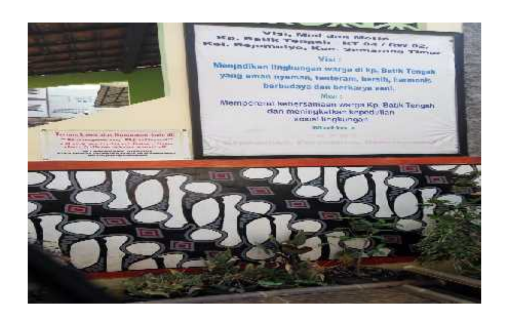
Figure 3. 9. Kampung Batik Djadoel Rejomulyo, Semarang