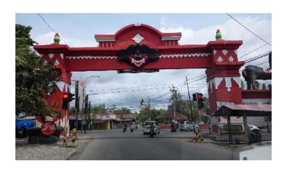
Figure 3. 41. Kasongan Pottery Craft Center, Bantul Yogyakarta.

"A lot of the employees come from Brebes because the quality of its clay is not good compared to the area of Yogyakarta and its surroundings, so the quality of the craft is different. Consumers can assess the quality of the products, and the products become less salable. So they don't open their own business in Brebes and move to become employee here"