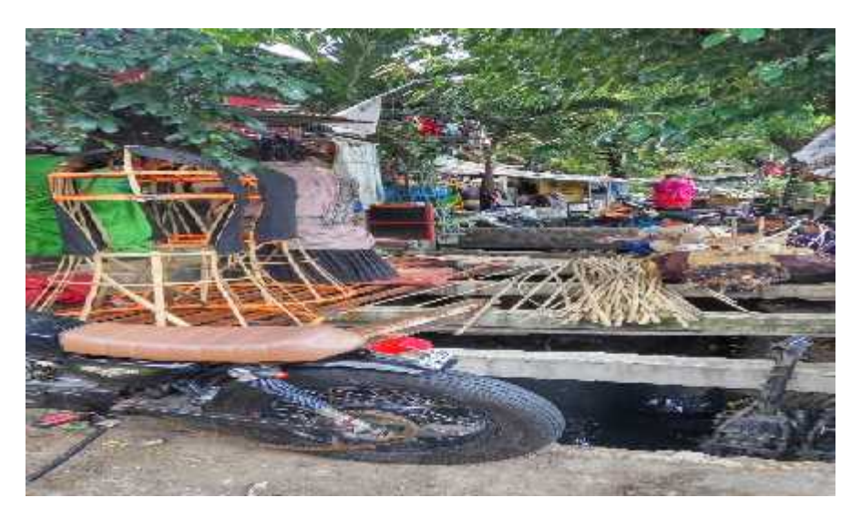
Figure 3. 30. Ondel-Ondel Frame Production, Al Fathir art studio

The production of ondel-ondel also requires persistence and patience. Even so, even though their only capital is observation, most craftsmen have been able to do it. They generally do self-taught in the learning process of making ondel-ondel. There are no specific instructors or foremen, they usually remind each other if one of the craftsmen makes a mistake or there is a lack in making ondel-ondel.