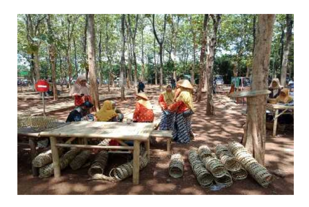
Figure 3. 16. Minggon Jati Activities, Batang Regency