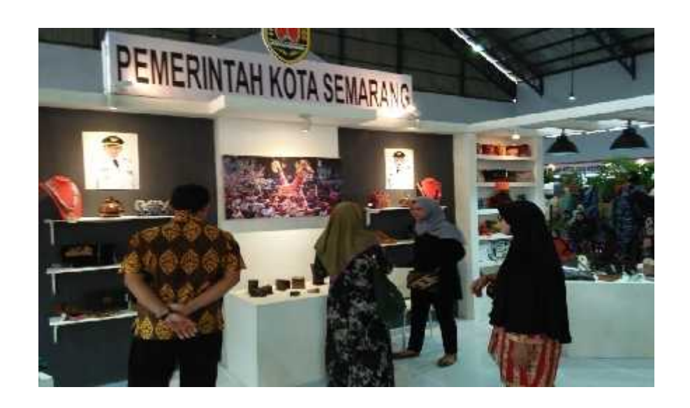
Figure 3. 12. Semarang City Government Participation in Batik exhibition

The batik entrepreneurs in Djadoel village, Semarang are not only having tendencies on economics, but alson in social and education about batik. This is evidenced by the batik making practices for visitors or tourists both from within and outside of the country. Apart from entrepreneurs, the Semarang city government is also concerned about the development of Semarangan batik, namely by participating in a series of batik exhibitions held in various cities.