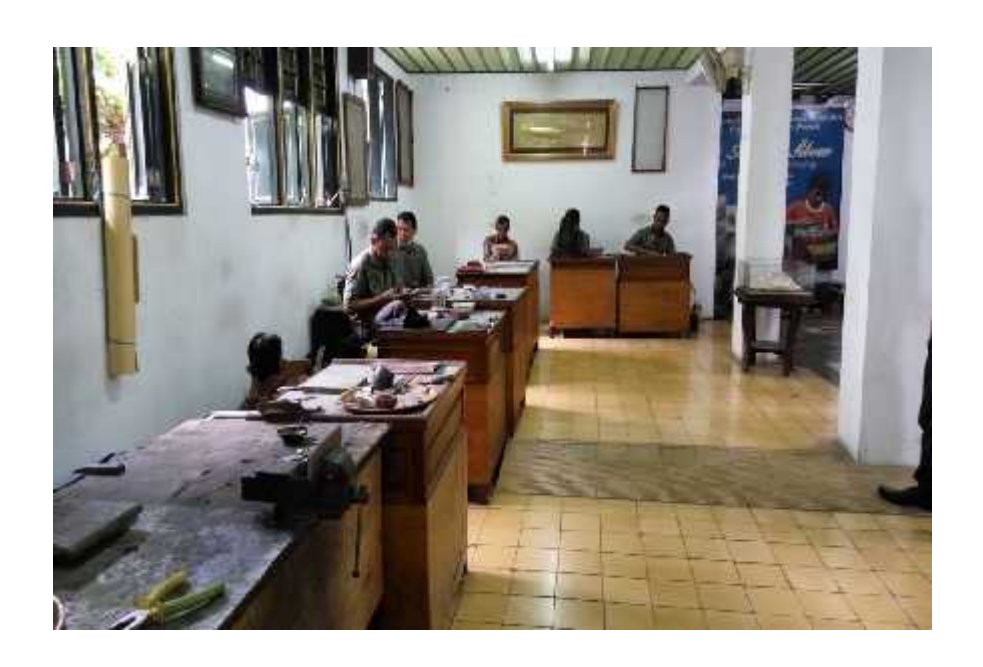
Figure 3. 54. Silver Craft Production Room

Most of the employees who in charge of making silver handicrafts are men, it is different from batik craft even though it has a high level of complexity, but for metal-based handicrafts it is still run by the majority of men. Basically there is no particular reason why men dominate, but it has become a hereditary tradition in this business, the producing process is mostly done by men, while women are more likely to work in the finishing section.