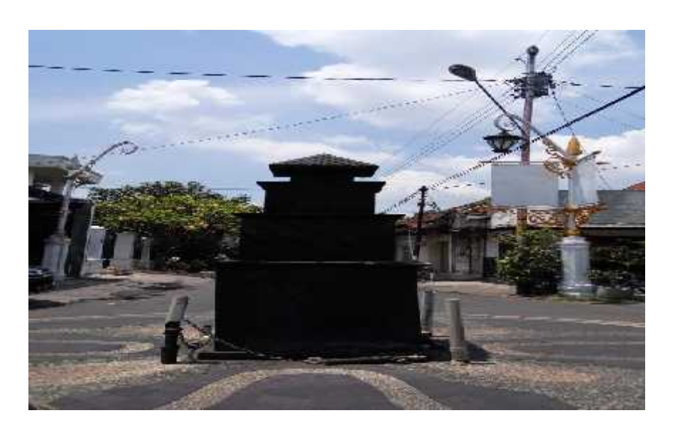
Figure 3. 18. Laweyan Batik Village Monumen, Solo

During the Kingdom administration, the Laweyan community consisted of 2 regions: West Laweyan and East Laweyan, separated by the Laweyan River. The characteristics of the population are very different. Residents of Laweyan Barat, in economic and cultural matters, have more to do with the facilities provided by the king. On the other side, the residents of Laweyan Timur, which is inhabited by a large number of traders and batik entrepreneurs, focus more on Laweyan (dead) market. The dead market is now the Lor (North) and Kidul (South) market village.