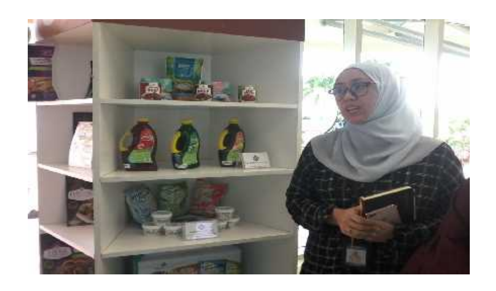
Figure 4. 68. Products Yielded in DARe Programs