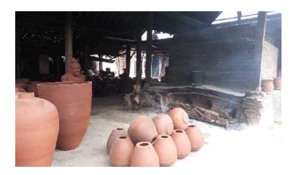
Figure 3. 46. Pottery Burning Room

The process of making ceramic crafts can be categorized depending on the weather, besides the patience and imagination of the craftsmen. Weather plays an important role in the drying process. That process is not done directly under the sunlight, but is done indirectly. Generally, they put half--finished products in a separate room equipped with a fireplace or furnace which produces smoke. The condition in this roomis made warm so that the product can dry slowly. This process greatly affects the quality of the product. The water content on cloudy day influence the drying process become slower and it affects to the quality of the product.