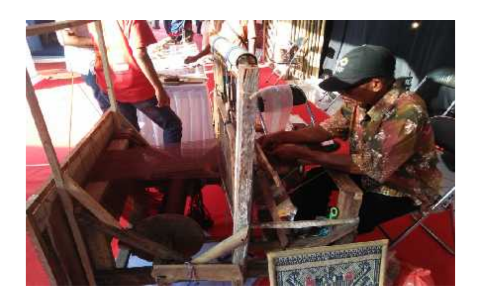
Figure 3. 35. Tenun Troso Production Process

such as weaving, convection and furniture drop dramatically. The turnover of the weaving business itself, according to Mr. Buchori, decreased to 50%, which at first had a monthly turnover of 50 million IDR, decreasing to 20 million IDR to 30 million IDR.