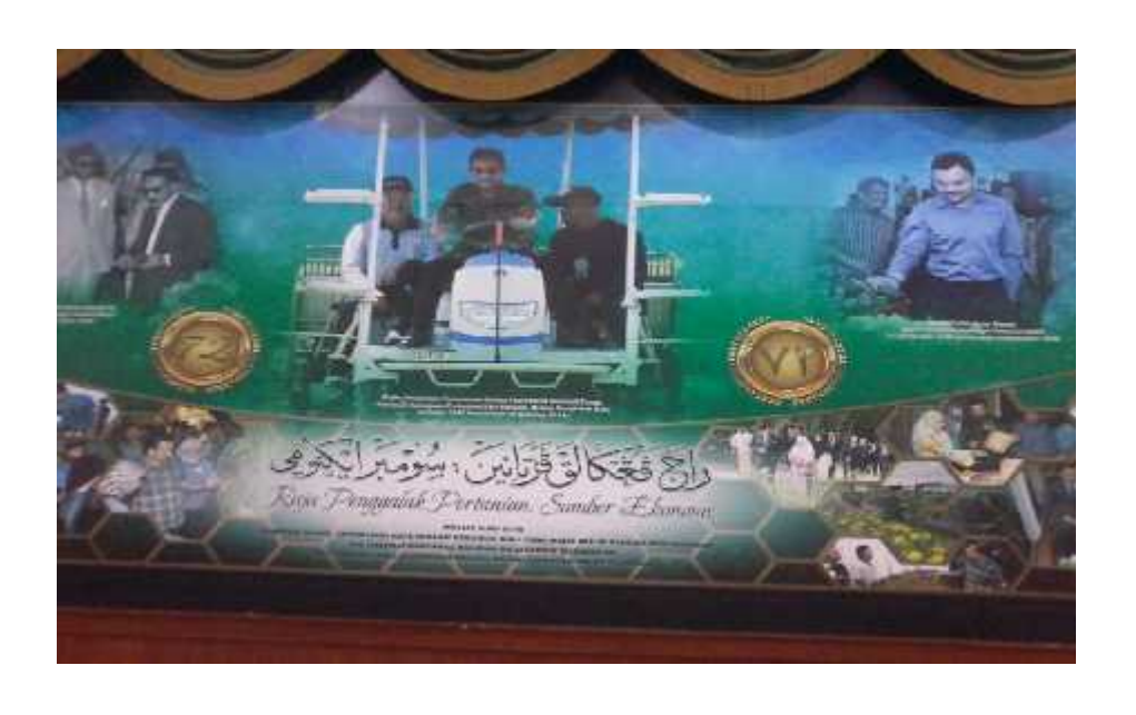
Figure 4.73. "Raja Penggalak Pertanian: Economy Resource"