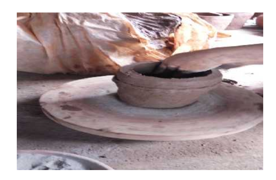
Figure 3. 47. The Process of Making a Vase