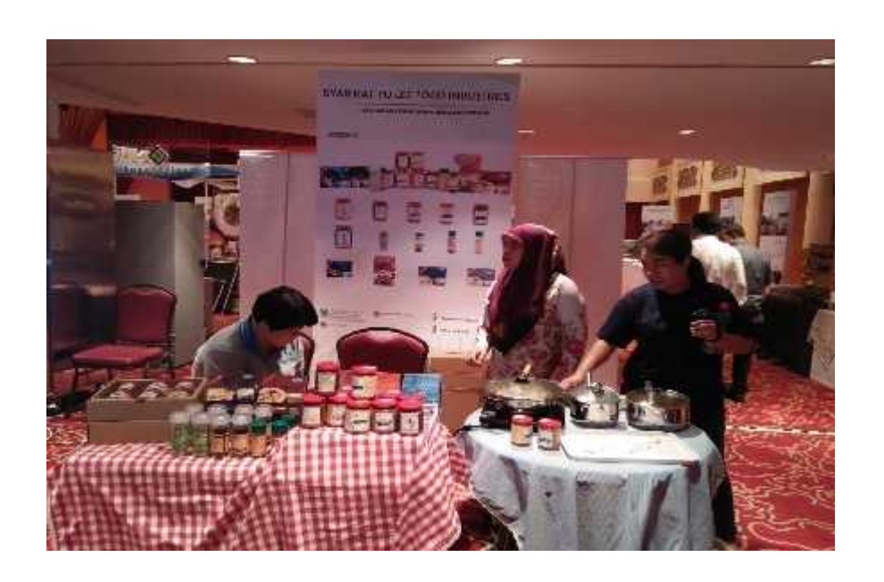
Figure 4.77. Stand of Red Meat