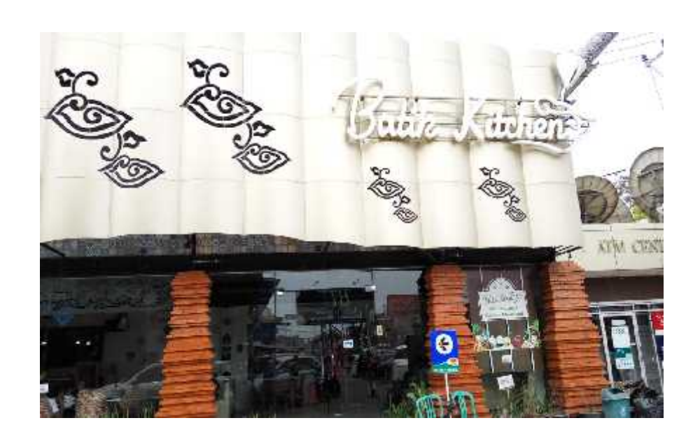
Figure 3. 58. Restaurant with Batik Atmosphere