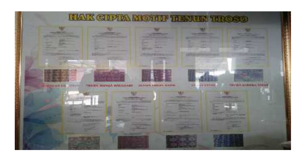
Figure 3. 34. Tenun Troso Pattern Copyright

business which also produces the same product. If Ampel Jaya only produces Balinese weaving, KF Kayra main products are Balinese weaving and also other products as previously mentioned above. Unlike Ampel Jaya and KF Kayra, the Tenun Limo weaving business produces a wide range of products other than Balinese weaving. The motif of the weaving products has been registered for copyright.