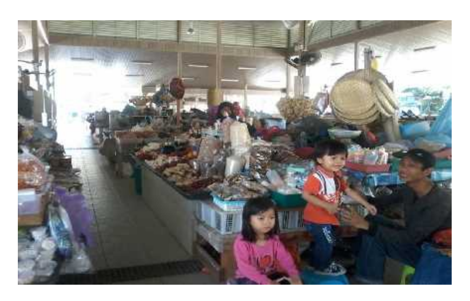
Figure 4. 91. Handcrafts at KianggehMarket

More interestingly, this market provides not only various cakes, but also household goods made from bamboo and sago palm leaves. Traditional spices are always available there. There are male and female sellers who frequently take care of children while doing their job so that the atmosphere in this market becomes even more crowded.