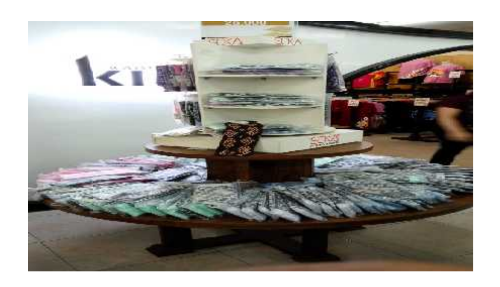
Figure 3. 59. Batik Socks Products